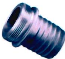
5 PCS – Aluminum pin Lug Hose Shank Coupling - 2" Male NSPM x 2" Hose Shank