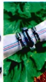
10 PCS – 2 " Quick Coupling for Water Pipes Aluminum Pipe Fitting Hose Quick Connector with 50 pcs. Clamp