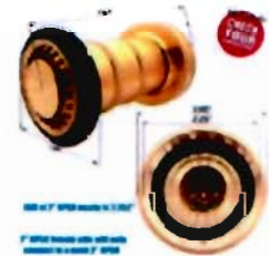
5 PCS.- 2 1/2" NPSH Fire Hose Nozzle Brass Fire Equipment Heavy Duty Industrial Fog Nozzle