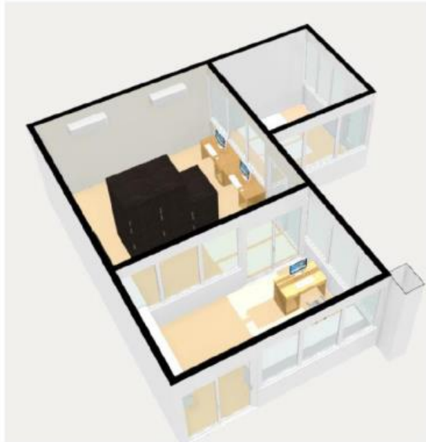
DENR Regional Office 3 Server Room Proposed Layout