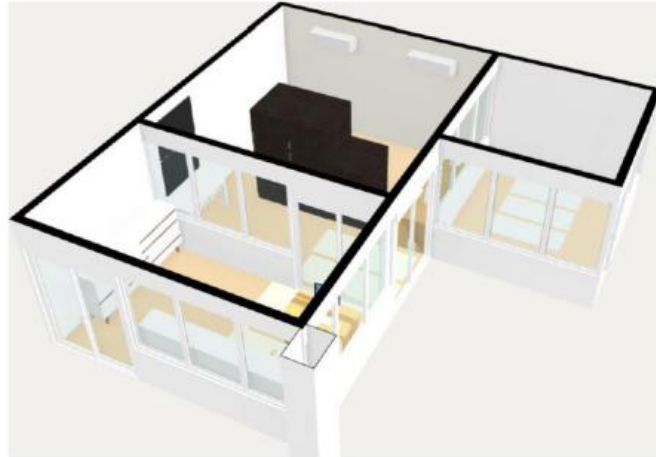
DENR Regional Office 3 Server Room Proposed Layout