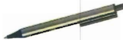
Grey pen with ENR Logo