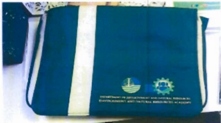
Laptop bag with colored motif (gray) and DENR and ENRA Logo