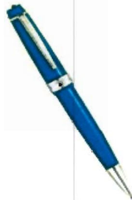
Blue pen with ENRA logo