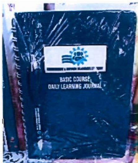
Blue Notebook with ENRA logo and Course Title