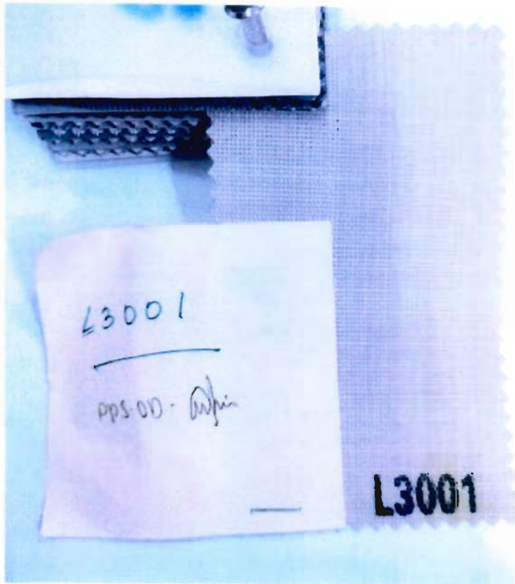
SUNSCREEN FOR PLANNING