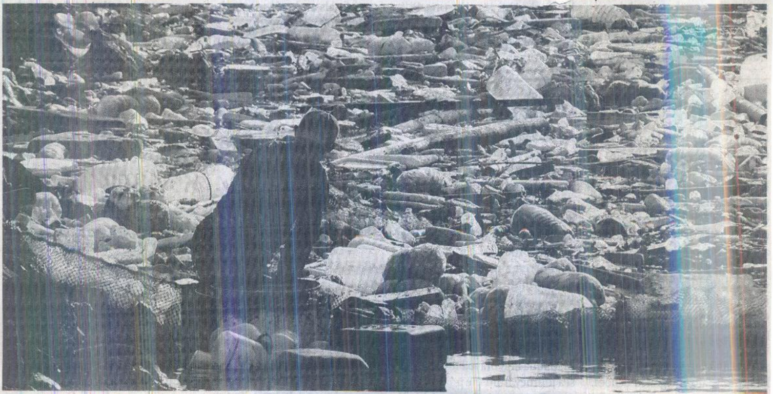
TRASH FOR CASH A man collects discarded plastic materials for possible resale from Manila Bay in Pasay City on Aug. 14, 2023.