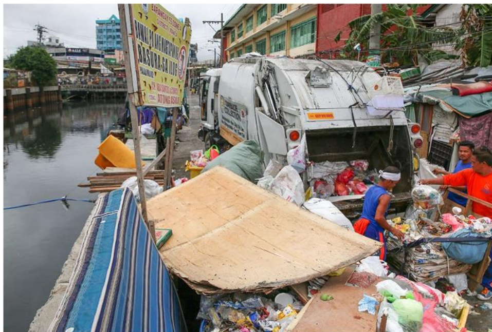
Trash collectors gather garbage at a creekside residential area in Tondo Manila on June 26, 2019.