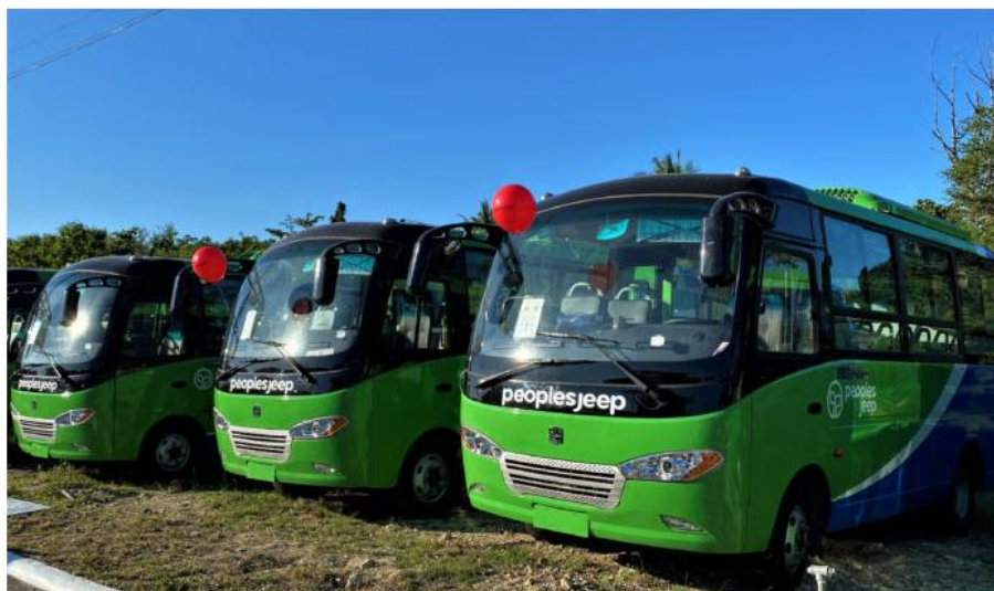
shows units the Cebu People's Multi-Purpose Co-operative launched as part of the country's public-utility vehicle modernization program.

Aco-operative in Cebu City announced the roll out of 55 units as its support to the country's public-utility vehicle modernization program.