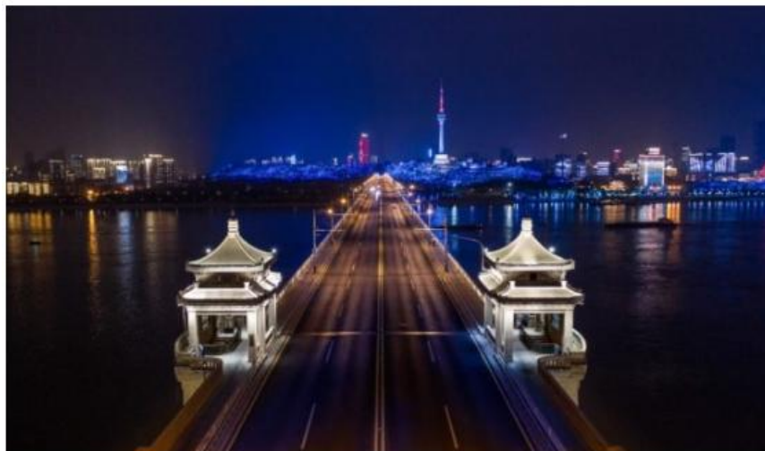
This aerial photo taken on March 16, 2020 shows a view of the Wuhan Yangtze River Bridge at night in Wuhan in China's central Hubei province.

Agence France-Presse / 11:41 AM March 22, 2020