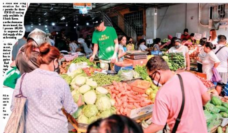
CONSUMERS in a public market in Marikina seem to not mind social distancing as ordered by the government as a precautionary measure against the coronavirus disease 2019.

“Other government agencies located in areas which are not placed under the Enhanced