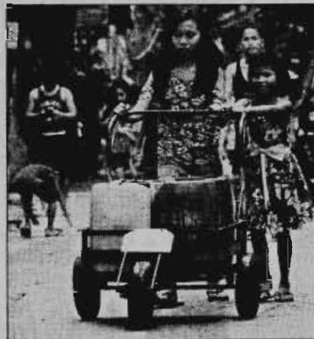
Children haul water in Batasan, Quezon City yesterday.

Duterte also warned Metropolitan Waterworks and Sewerage System (MWSS) officials that they would get fired if he was not satisfied with their