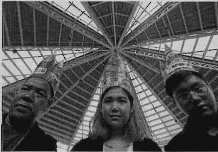
BRAND AUDIT Members of environmental group EcoWaste Coalition show crowns adorned with product labels by the top companies.

The brand audits, defined in the report as "identifying, counting and documenting the brands found on plastic and other collected packaging waste to help identify the corporations responsible for pollution," were done across 51