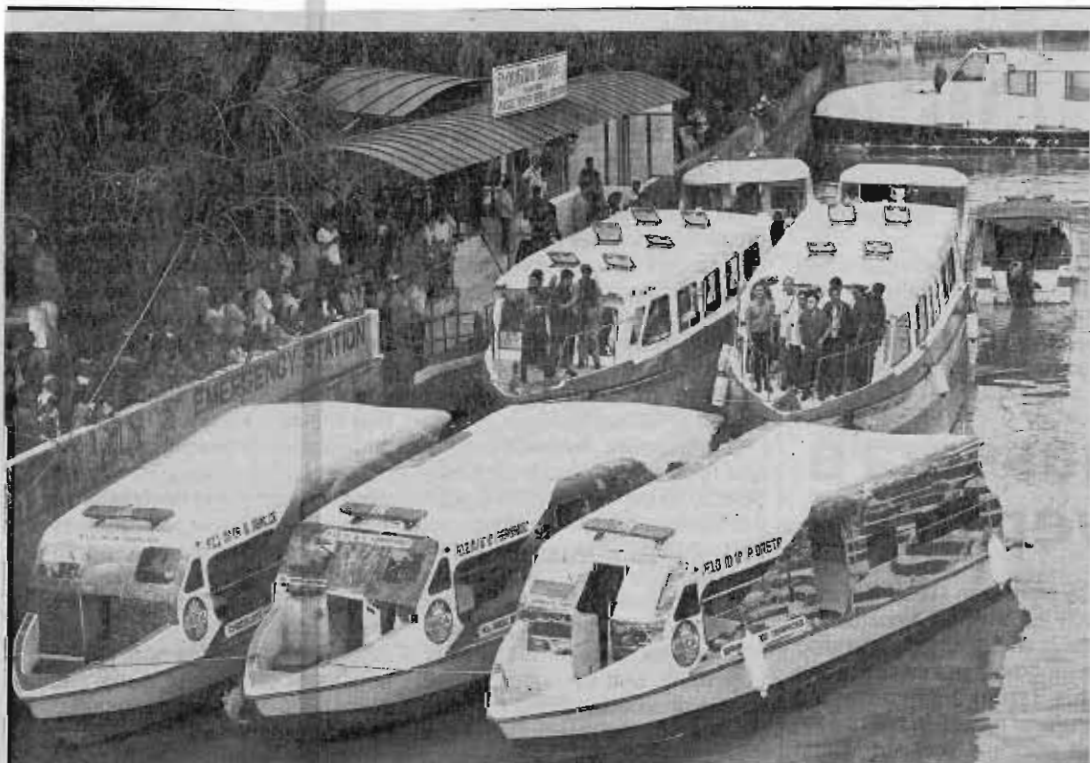
GOVERNMENT officials lead the reactivation of the rehabilitated Pasig River Ferry Service (PRFS) with free ride offer for a month. The PRFS is expected to ease traffic congestion in Metro Manila. (Ali Vicoy)

Stations are fully-equipped with comfortable seats, convenient restrooms and free internet connectivity for passengers waiting for rides. (Dhel Nazario)