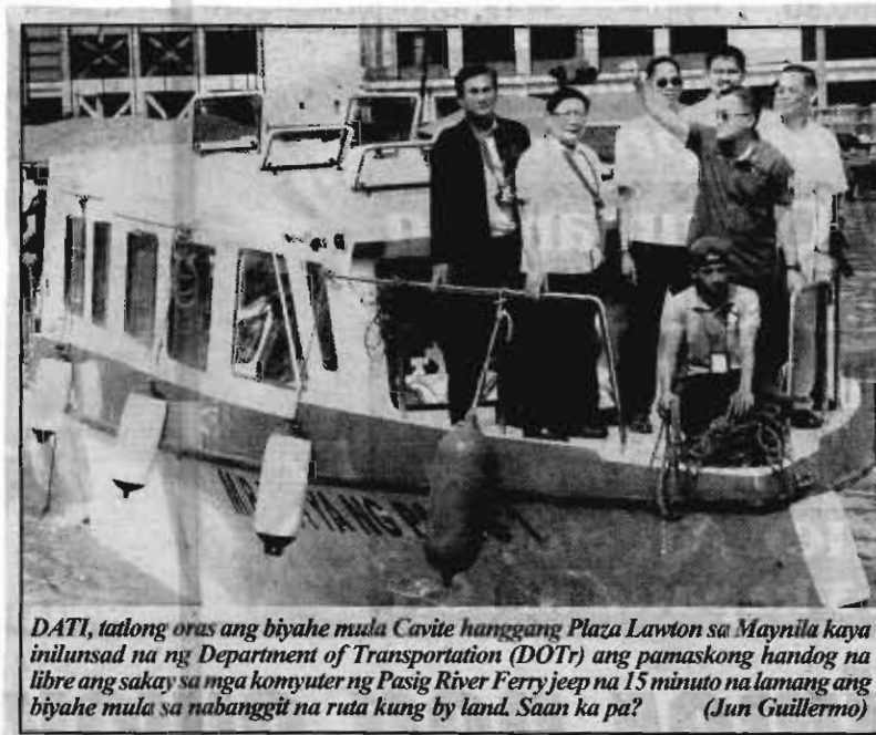
DATI, tatlong oras ang biyahe mula Cavite hanggang Plaza Lawton sa Maynila kaya inilunsad na ng Department of Transportation (DOTr) ang pamaskong handog na libre ang sakay sa mga kompyuter ng Pasig River Ferry jeep na 15 minuto na lamang ang biyahe mula sa nabanggut na ruta kung by land. Saan ka pa?