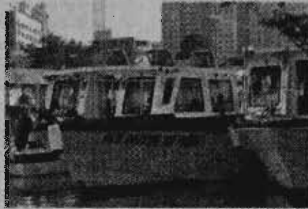
VICO SOTTO FB PAGE