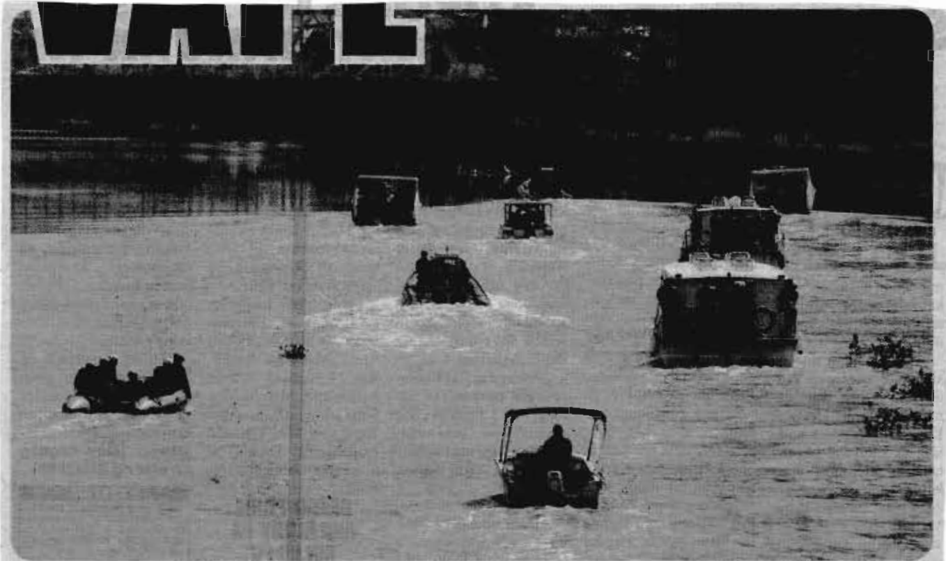
MULING bumiyahе ang Pasig River Ferry sa relaunching nito kahapon sa Lawton Ferry Terminal sa Maynila. Ang bagong river taxi ay bibiyahе mula Lawton hanggang sa Pasig City.