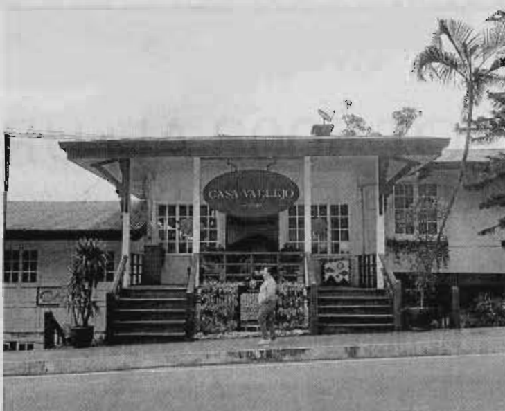
HERITAGE HOTEL Casa Vallejo, a heritage building and the oldest hotel in Baguio City, was nearly evicted by an Ibaloy family which was granted an ancestral land title covering this property. —VALERIE DAMIAN

The court made this argument when it nullified 28 CALTs issued in 2010 to the heirs of Josephine Molintas Abanag and the heirs of Piraso, also known