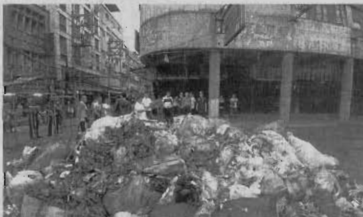
EYESORE The cause of the mayor's dismay: Huge piles of trash scattered everywhere on the street. —MANILA PIO

In an earlier interview, the mayor told the Inquirer that