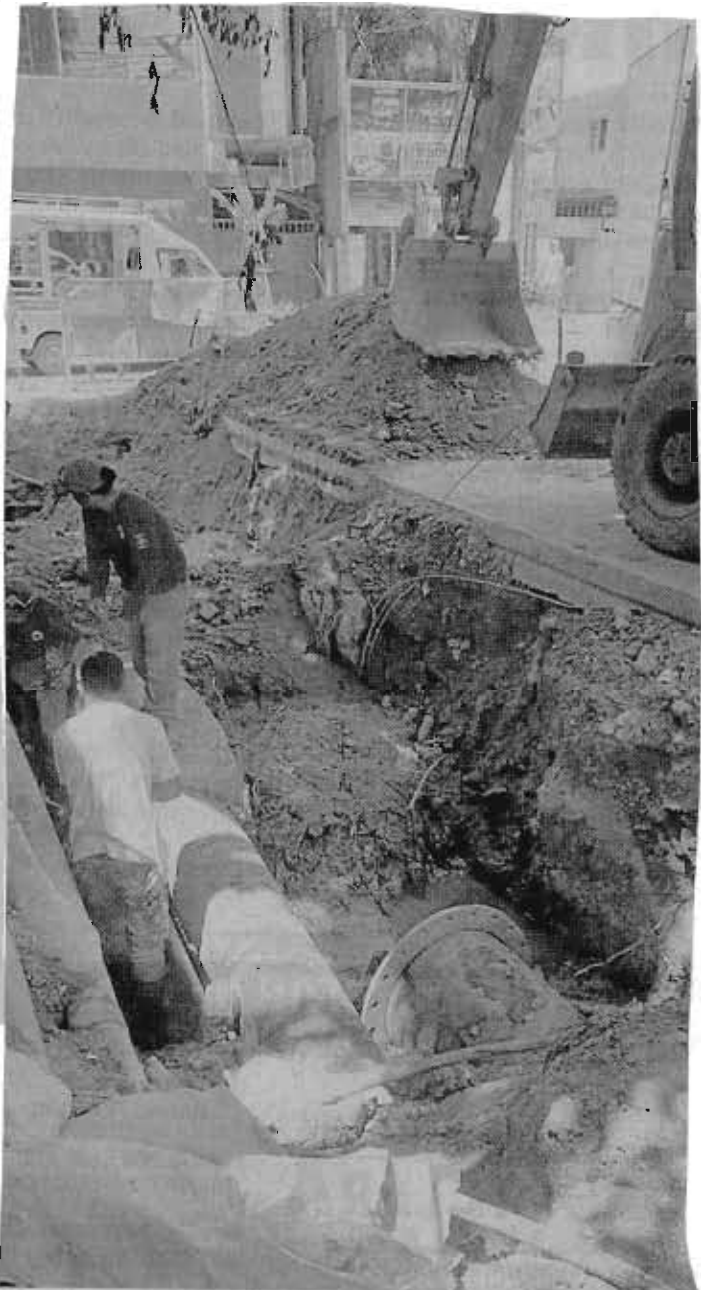
STILL UPGRADING Nearly a year after the reopening of Boracay, the coverage of the centralized sewer system remains at its preclosure area of 61 percent of the 1,032-hectare island. Boracay Island Water Co., a water service provider controlled by the Ayala subsidiary Manila Water, says its focus had been on the upgrading of sewer pipes along the island's main road and the putting up of individual sewage treatment plants. —PHOTO COURTESY OF BORACAY REHABILITATION CONTINUES

In November last year, the National Bureau of Investigation filed graft and malversation complaints at the Office of the Ombudsman against former and incumbent officials of Malay for