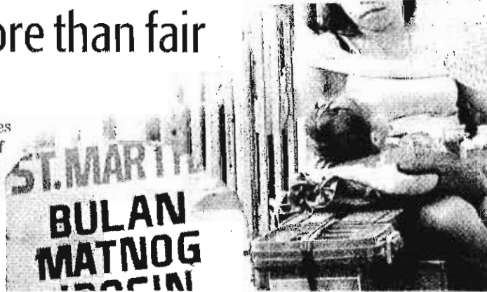
Annual exodus Bus terminals in Metro Manila have filled up since yesterday for the Undas observance when travel peaks.

At a press conference in Malacañang yesterday, Esperon stressed that the sharing arrangement could still be increased depending on the inter-government joint