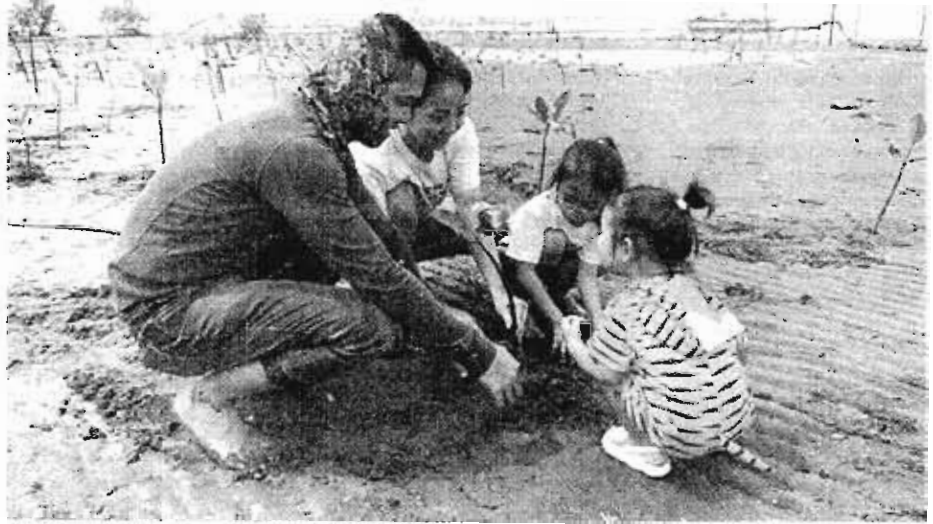
MEMBERS of the Sali Family recently conducted tree-planting activities and mangrove reforestation in Tibaguin, Hagonoy, in Bulacan.

The results have been very remarkable thus far. From 2017 to present, the One Child, One Tree movement's series of mangrove reforestation efforts saw the planting of 5,000 mangrove seedlings along the Tibaguin seashore in Hagonoy, Bulacan, as well