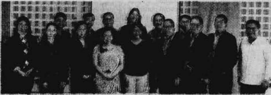
Stakeholders from both the private and public sectors pose after taking part in the roundtable discussion on responsible mining held at RCBC Plaza in Makati City.