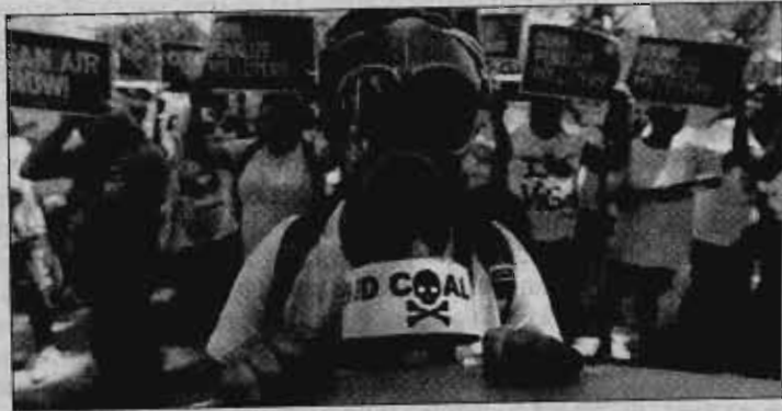
Power for the People together with representatives from communities affected by air pollution rally in front of the Department of Environment and Natural Resources office in Quezon City last Thursday to protest DENR inaction on a report on unhealthy air quality in the country and calling for an end to coal use. BOY SANTOS