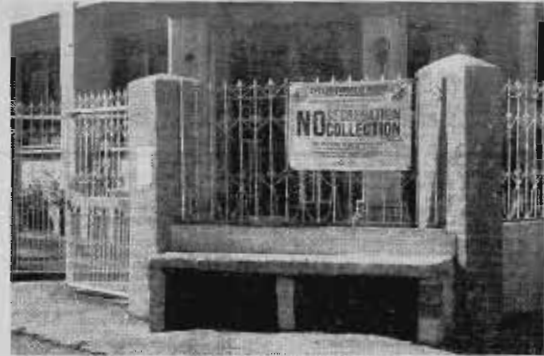
The new City Hall of Bacoor attests to the progress of the city achieved through good governance and adherence to the principles of sustainable development. Along with its continuing push for development, Bacoor implements stringent measures to protect its environment, as shown by posters reminding residents to comply with solid waste segregation policy.

BACOR CITY — Environment protection and sustainable development are paramount considerations in the efforts of the local government to usher economic growth and uplift the lives of the city's residents.