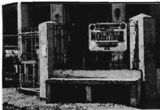
The new City Hall of Bacoor attests to the progress of the city achieved through good governance and adherence to the principles of sustainable development. Along with its continuing push for development, Bacoor implements stringent measures to protect its environment, as shown by posters reminding residents to comply with solid waste segregation policy.

Revilla also said that the additional revenues from the reclamation