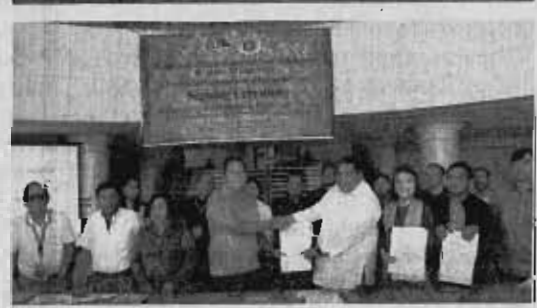
Through the signing of the Deed of Donations, a total of 31,892.54 bd. ft. of confiscated forest products were donated to the Province of Davao del Sur.