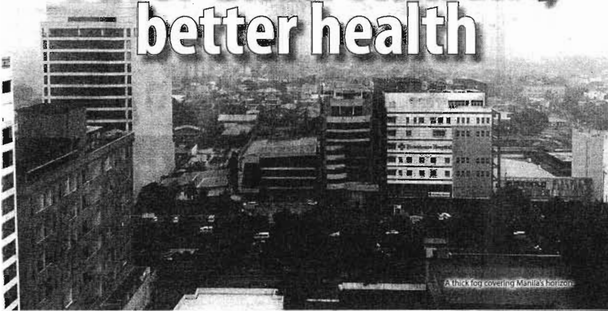
A thick fog covering Manila's horizon.