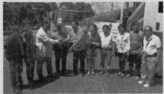
DENR Regions 11 and 13, in collaboration with MinDA, donate confiscated forest products to the Provincial Government of Davao del Sur.