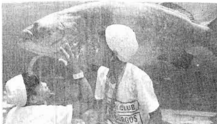
'Fish' be with you Muslim children, victims of Marawi war, watch a large grouper fish during a tour at Ocean Park in Manila.