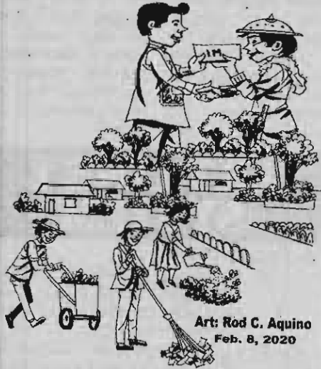
Art: Rod C. Aquino Feb. 8, 2020