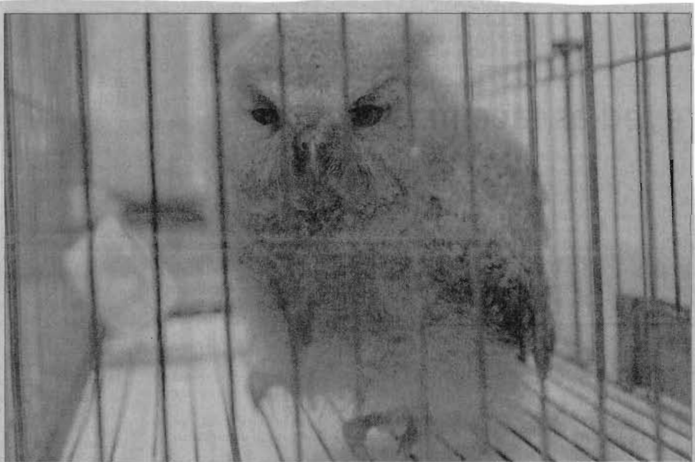
This baby owl was turned over to the Department of Environment and Natural Resources at the Ninoy Aquino Parks and Wildlife Center in Quezon City late last month after a mobile patrol rescued the bird that fled from its habitat during the Taal Volcano eruption in Batangas.