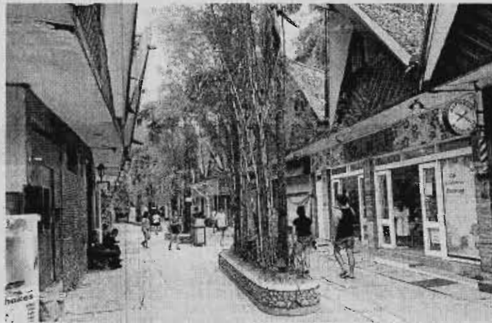
NEAR EMPTY D'Mall commercial complex on Boracay Island is supposed to be packed with local and foreign tourists at this time of the year but the travel ban and concern over the spread of the coronavirus have kept visitors away from the resort island in Aklan province.

Flights between the capital town of Kalibo in Aklan and Wuhan City in Hubei province in