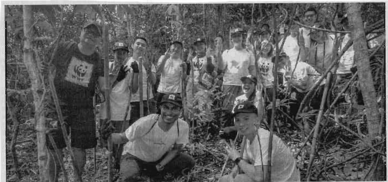
GCash users join staff from WWF-Philippines and GCash for a group photo after the tree-planting activity at Ipo Watershed

The remaining 4,000 seedlings were planted between October and December by WWF-Philippines and its local partners, with the backing of GCash.