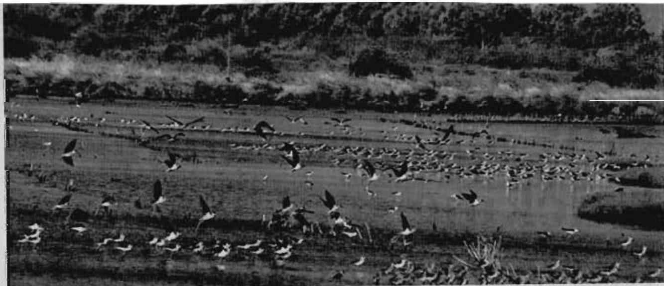
Wetlands play a vital role in the regulation of global nitrogen cycle and also serve as a carbon sink, it also help mitigate effects of climate change

The NOCWCA is also a haven for at least 73 species of waterbirds flocking in its prolific wetlands, including five globally threatened and two globally near-threatened species. Recently, it has three additional species namely: Eurasian