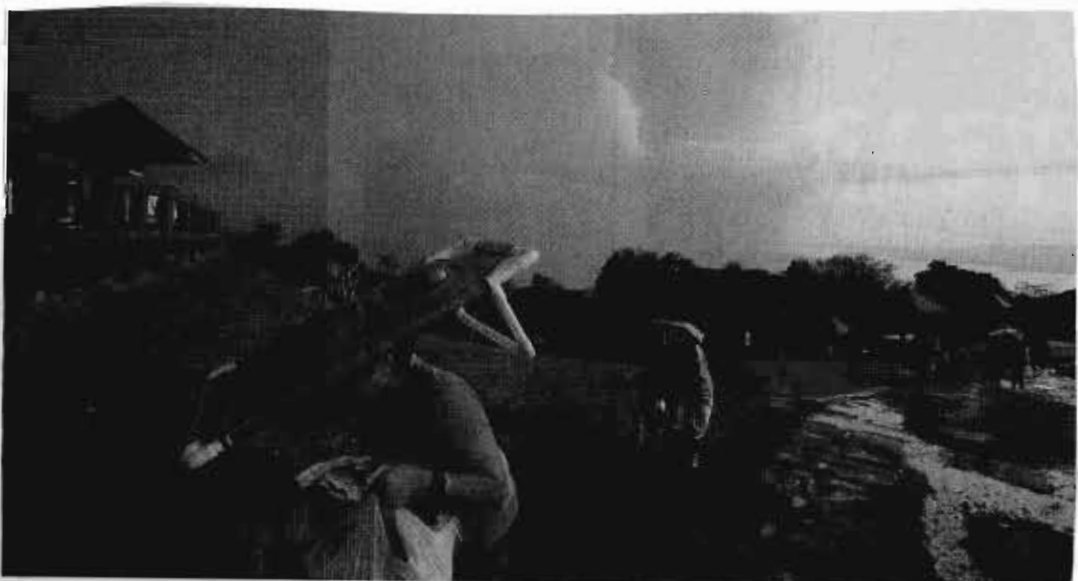
RAIN OF MUD Vacationers seek cover from wet ash as it drizzles at the volcano site. —RICHARD A. REYES