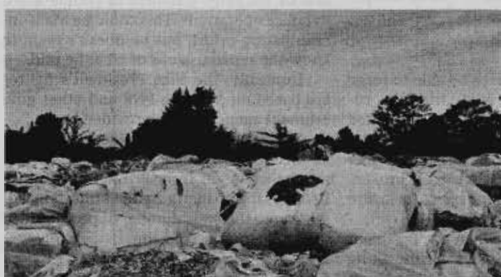
TOXIC MESS The pile of mostly plastic trash stored at the Phividec Industrial Authority compound in Tagoloan, Misamis Oriental, awaiting reshipment to South Korea.

The trash will be put in 60 container vans and will be transported by an international