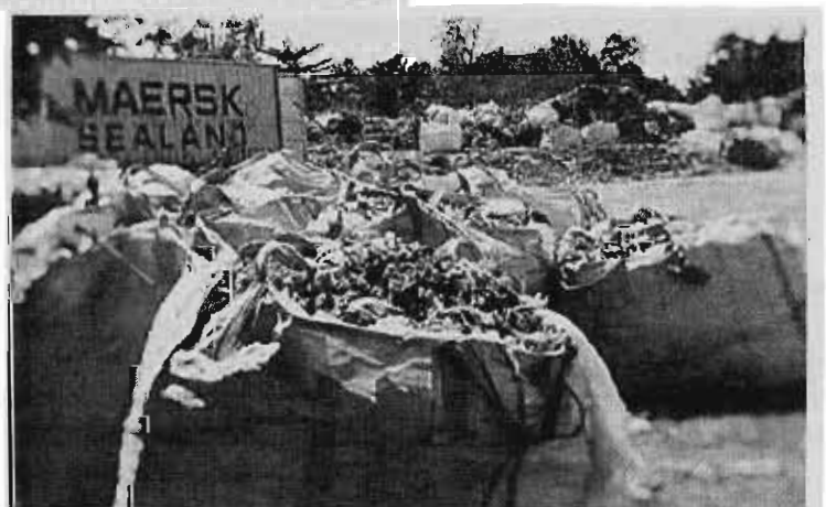
FOREIGN GARBAGE A file photo of industrial garbage packed in sacks, inside the Phividec Industrial Authority. The garbage was docked inside the premises of its consignee, Verde Soko Inc., in Tagoloan, Misamis Oriental last year after arriving from South Korea.

"Ratifying the Basel Ban Amendment and further prohibiting the export of all wastes to the Philippines will be our best legal protection against waste trafficking," the EcoWaste Coalition said. PNA