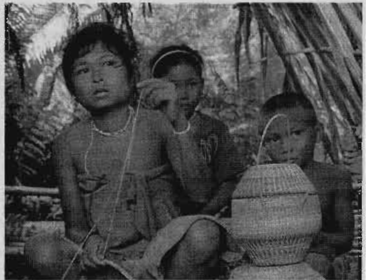
INDIGENOUS DWELLERS There are only three government-deployed forest rangers and a handful of volunteers from the indigenous Palaw'an tribe to look after its forests against wildlife and timber poachers.

A hiking blog said locals referred to Mt. Mantalingahan (2,086 meters above sea level)