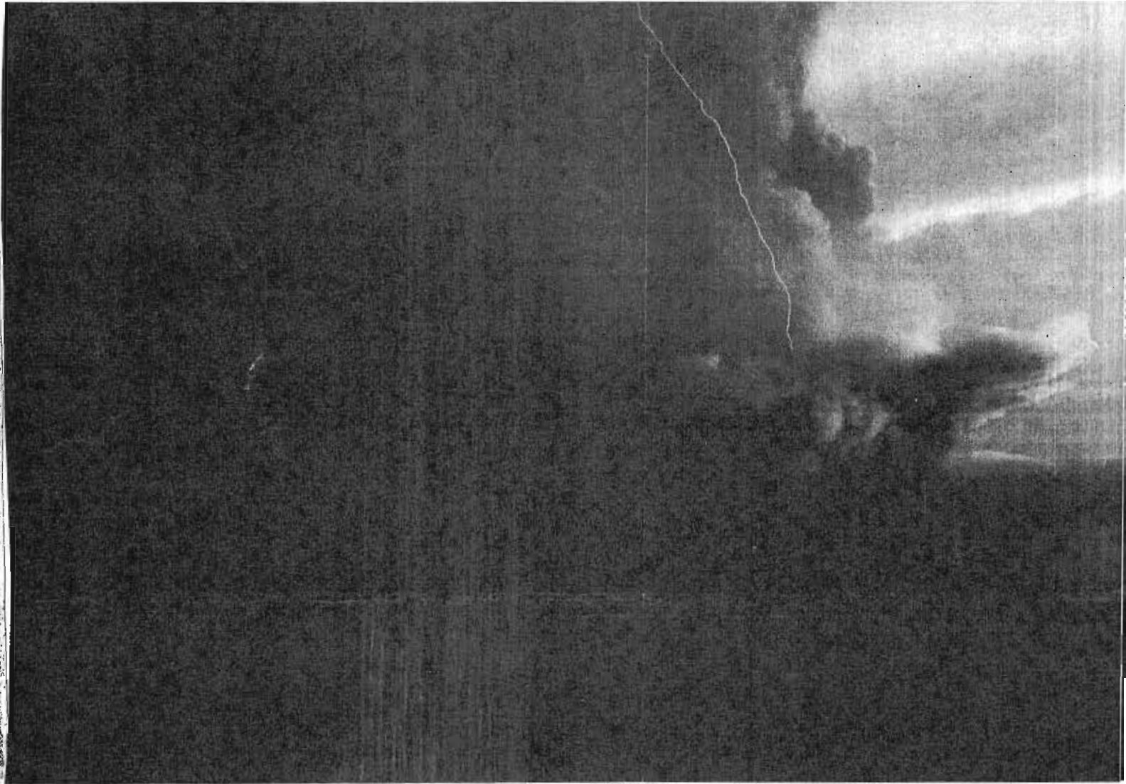
DANGER LEVEL Lightning strikes as volcanic activity intensifies on a rainy Sunday afternoon, as shown in this photo taken from Picnic Grove in nearby Tagaytay City.