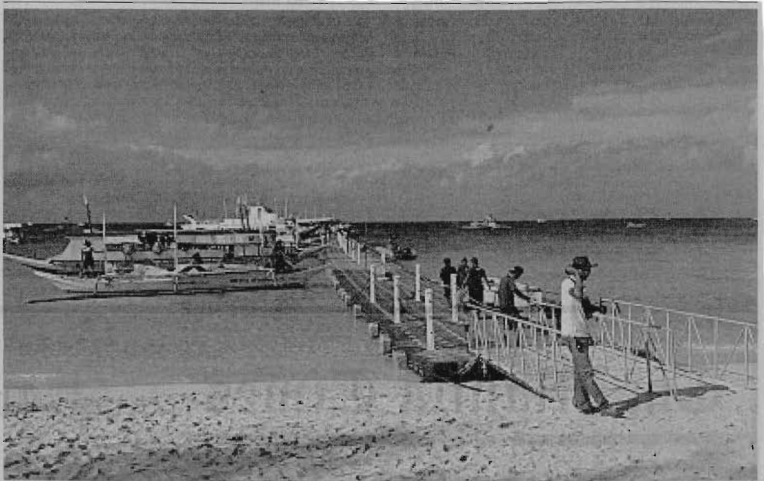
■ Photo shows one of the pontoons on Boracay Island in Malay town, Aklan. The government's inter-agency management group asked the local government to stop collecting fees from visitors using the bridge.