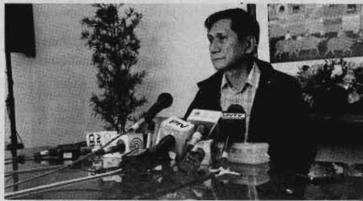
KINATAWAN Isa-isang sinasagot ni Environment Secreàtry Roy Cimatu ang mga mamamahayag sa isang pulong balitaan bago ito lumipad pa-Doha, Qatar kung saan tuluyang tutungo sa Baghdad, Iraq para sa posibleng paglilikas ng mga Pinoy worker.