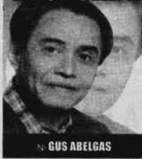
BY GUS ABELGAS