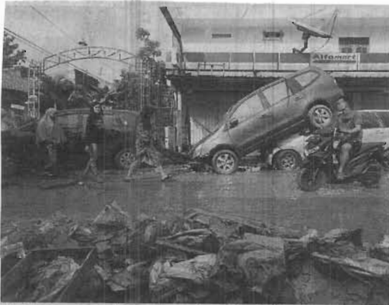
Residents walk near the wreckage of vehicles that were swept away by flood in West Java, Indonesia on Friday.