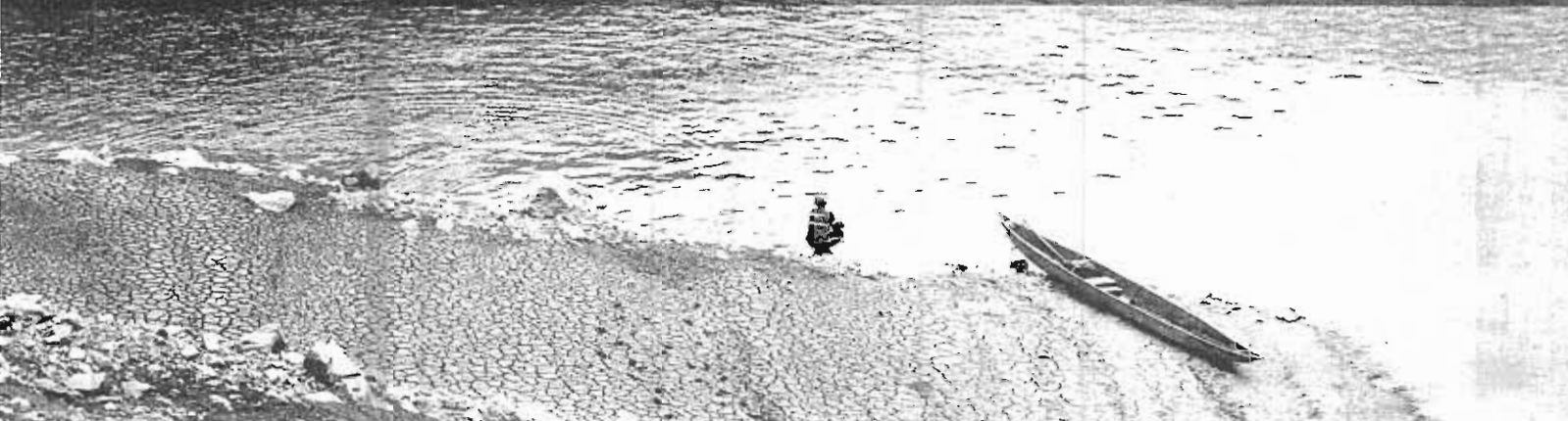
ANGAT FISHING In this photo taken in June 2019, a man casts a line into a section of Angat Dam, hoping to catch fish amid the continuing drop in the water level at the reservoir in Norzagaray town, Bulacan province. The bulk of Metro Manila's water supply comes from Angat.