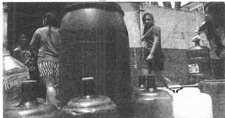
Waiting in vain? Residents of Brgy. Oranbo, Pasig City wait for precious water to trickle from their faucets after going without it for four days.