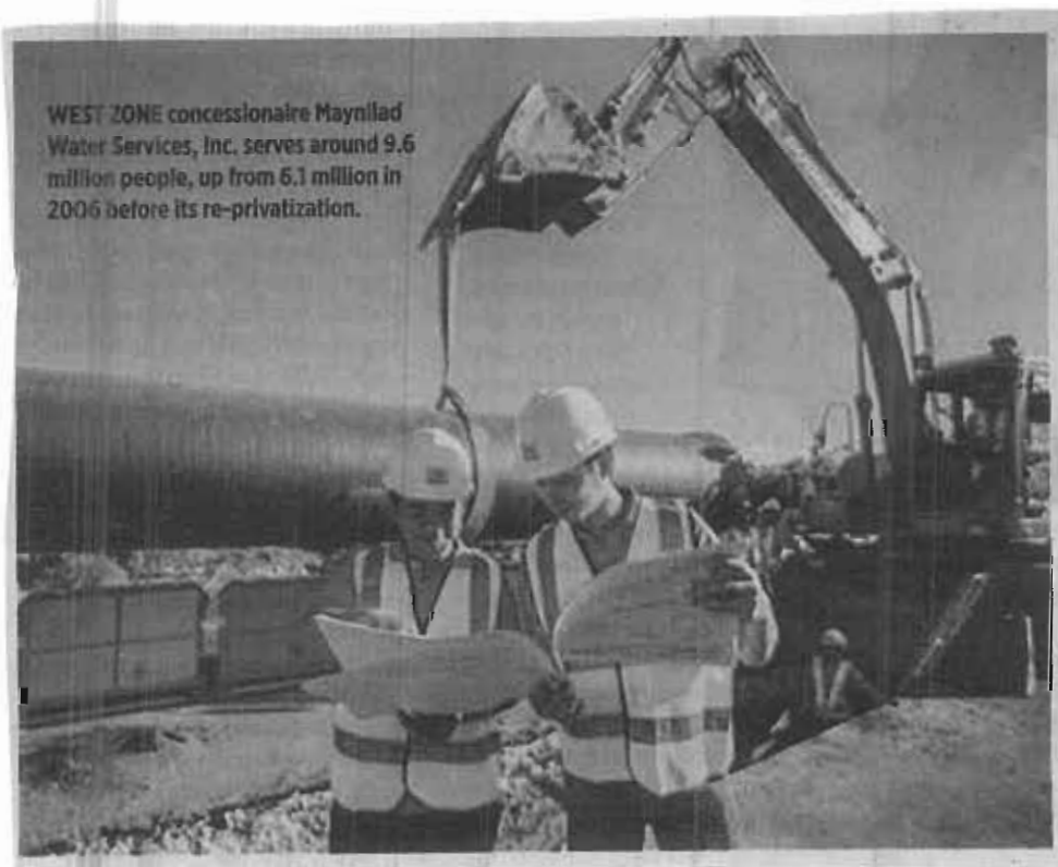
WEST ZONE concessionaire Maynilad Water Services, Inc. serves around 9.6 million people, up from 6.1 million in 2006 before its re-privatization.

Maynilad also supplies water to the cities of Cavite, Bacoor and Imus, and the towns of Kawit, Noveleta and Rosario, all in Cavite province. — VVS