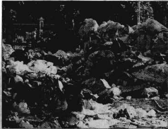
National Parks Development Committee workers collect garbage from Rizal Park yesterday. Officials said the volume of garbage hauled from the park after the New Year's Eve celebration was less than the 60 metric tons collected during the Christmas revelry.