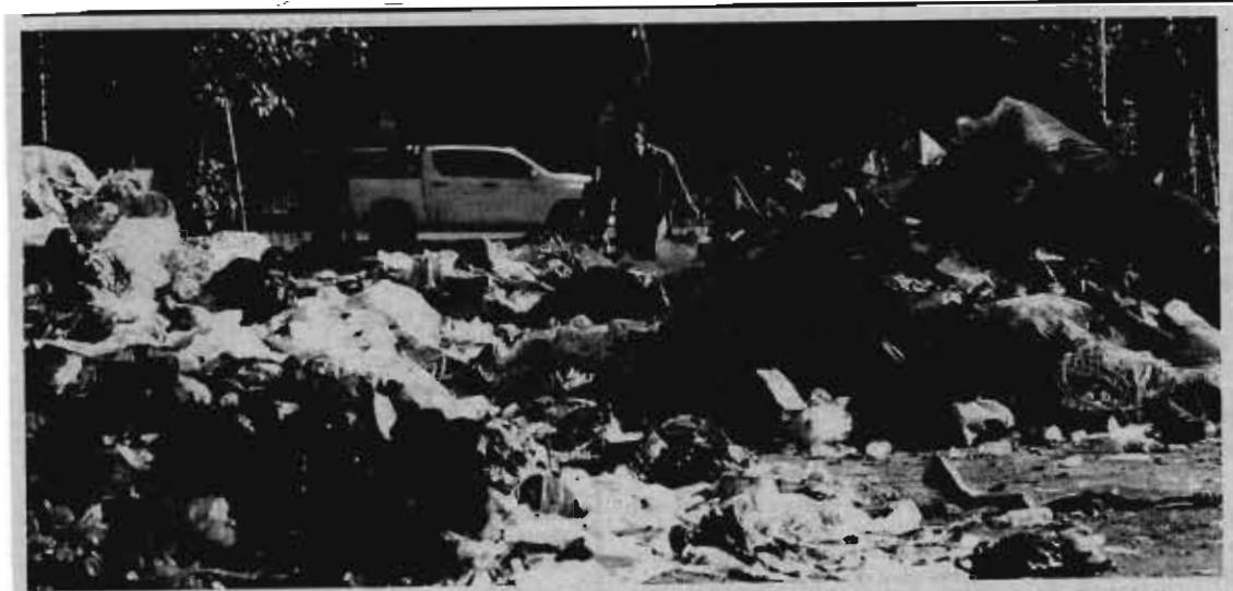
BASURA SA LUNETA Anim na truck ng basura ang nahakot ng mga tauhan ng Department of Public Safety (DPS) sa Rizal Park matapos ang pagsalubong sa Bagong Taon, nitong Miyerkules.