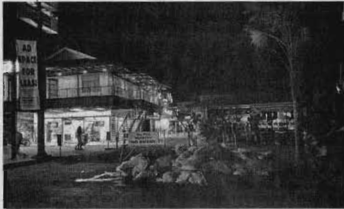
NO COLLECTION Bags of trash are left uncollected in a spot surrounded by shops, restaurants and hotels on Boracay Island in Aklan province a week after Typhoon “Ursula” battered the Visayas. —CONTRIBUTED PHOTO

Another resident and business operator said collection of garbage started only Thursday morning, a week after the typhoon hit the island.