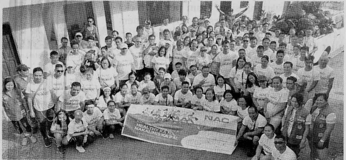
Nickel Asia Corp. group during the World Environment Day 2019.

The NAC-wide plogging was simultaneously conducted by NAC employees and their partners in their respective communities from the company's mining operations