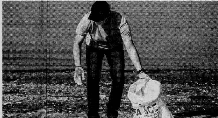
■ Haribon Foundation conducts coastal clean-up activities year-round at the Las Piñas-Parañaque Critical Habitat and Ecotourism Area, which is considered the last mangrove refuge in Manila Bay.

Recently, an endangered pawikan , or sea turtle, was found dead in Quezon province with plastic waste lodged inside its throat. According to a 2018 report by the Ocean Conservancy, plastic pollution in our marine ecosystem not only choke