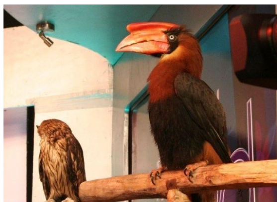
Palawan hornbill