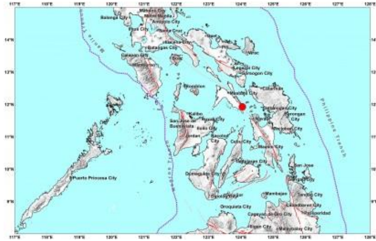
Epicenter of the magnitude 6.6 quake in Masbate