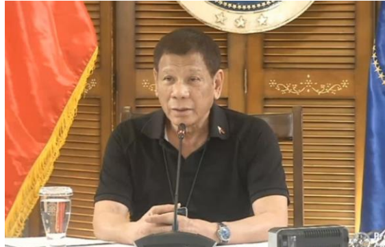
Pres. Duterte: Back to GCQ for Metro Manila.

President Rodrigo Duterte on Monday eased quarantine restrictions in Metro Manila and nearby provinces despite fears that the healthcare system will collapse amid the continuous surge of coronavirus disease 2019 (COVID-19) cases.