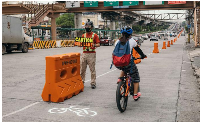
Greenpeace pushes for more protected bike lanes in major roads and highways.

Environmental organization Greenpeace reiterates the call for more protected bike lanes which it deems “essential for building better, more livable cities.”