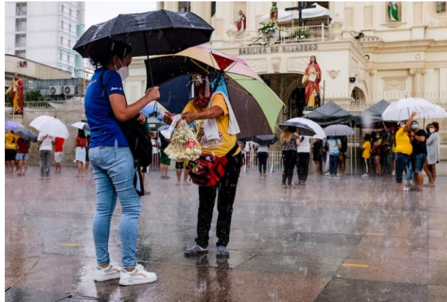
A sampaguita vendor makes a sale under the heavy rain in front of the Quiapo church in Manila on August 16, 2020.

Posted at Aug 17 2020 02:10 PM | Updated as of Aug 18 2020 02:18 AM