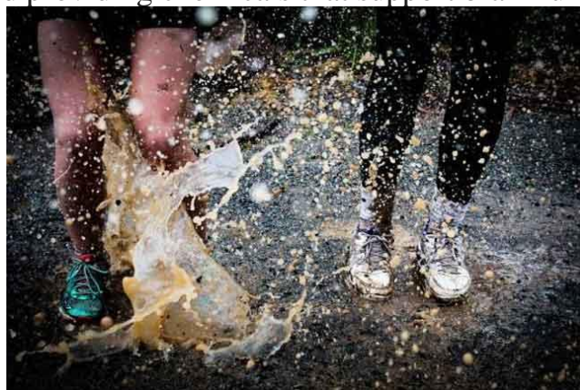
Children need diverse microbiomes in their environment to develop healthy immune system.

Our gut, skin and airways harbor distinct microbiomes — vast networks of microbes that exist in different environments. The human gut alone harbors up to 100 trillion microbes, which outnumber our own human cells. Our microbes provide services that are integral to our survival such as processing food and providing chemicals that support brain function.