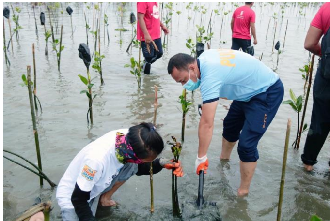
Department of Environment and Natural Resources and San Miguel Corporation Foundation plant about 1,000 propagules of Bakauan babae scientific Rhizophora mucronata were in a 10-hectare coastal area of Tibaguin village in Hagonoy, Bulacan.