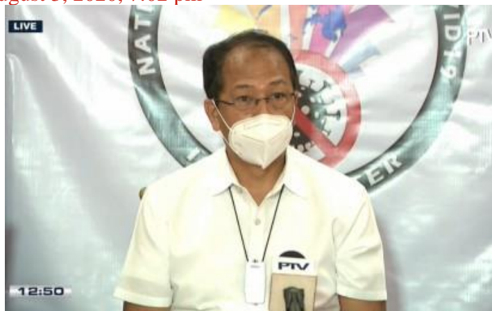
National Task Force (NTF) Against Covid-19 chief implementer and Presidential Adviser on the Peace Process Secretary Carlito Galvez Jr.