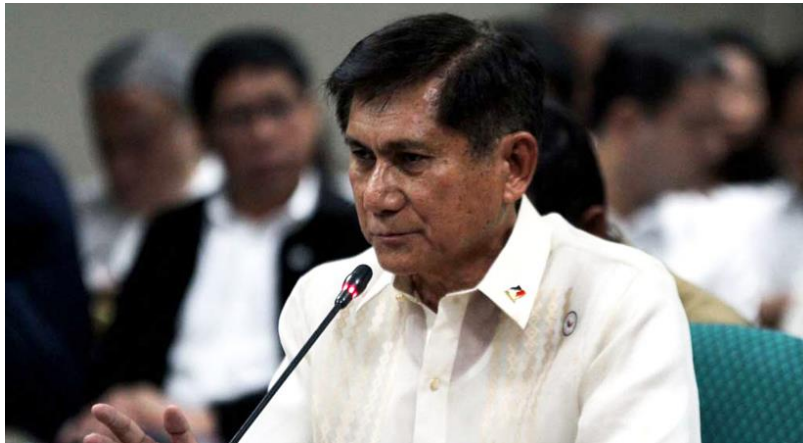
DENR SECRETARY ROY A. CIMATU

THREE ADDITIONAL solar-powered sewage treatment plants will be built along major river systems in Metro Manila as part of the government's efforts to rehabilitate Manila Bay, the Department of Environment and Natural Resources (DENR) said.