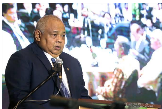
Executive Sec. Salvador Medialdea

Government agencies have been directed to operate with up to 50 percent of their total workforce on-site during the modified enhanced community quarantine (MECQ) in Metro Manila and four nearby provinces.