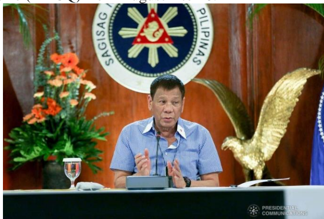
President Rodrigo Roa Duterte

President Duterte sought the middle ground with medical frontliners as he approved on Sunday night the recommendation to place Metro Manila, Bulacan, Cavite, Laguna, and Rizal back under the modified enhanced community quarantine (MECQ) from August 4 to 18.