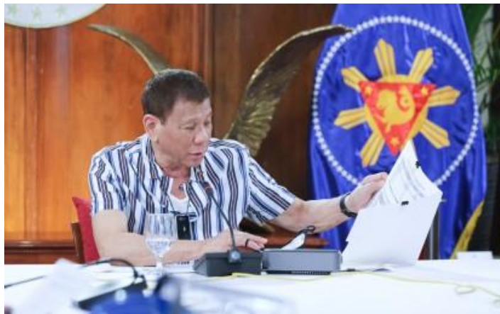
President Rodrigo R. Duterte (file photo)

MANILA – President Rodrigo R. Duterte has approved the proposed PHP4.506 trillion national budget for 2021 during a special meeting with the Development Budget Coordination Committee (DBCC) held on July 30, the Department of Budget and Management said Sunday.