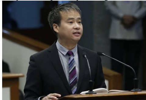
Sen. Joel Villanueva

Senator Joel Villanueva said essential personnel such as street sweepers and garbage collectors should also be entitled to hazard pay given the risks they face especially during this time of COVID-19 pandemic.