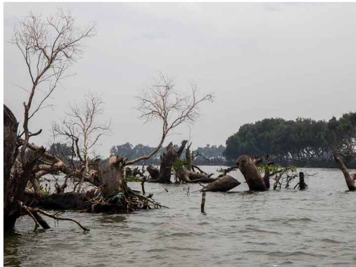
This 2019 file photo shows Barangay Taliptip in Bulakan, Bulacan