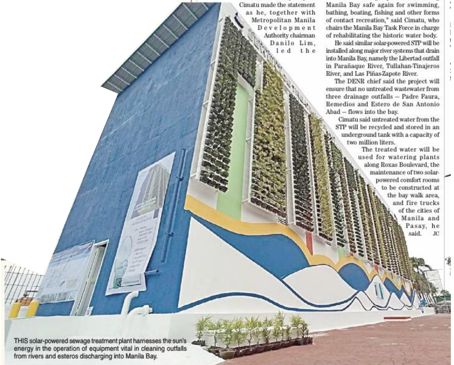
THIS solar-powered sewage treatment plant harnesses the sun's energy in the operation of equipment vital in cleaning outfalls from rivers and esteros discharging into Manila Bay.

The treated water will be used for watering plants along Roxas Boulevard, the maintenance of two solar-powered comfort rooms to be constructed at the bay walk area, and fire trucks of the cities of Manila and Pasay, he said. JC