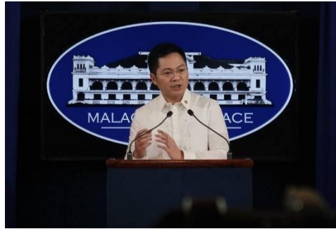
Cabinet Secretary Karlo Nograles

The government is working to chart a "safe course" for the Philippines through these uncertain times and recover its gains disrupted by severe impact of the coronavirus pandemic, Cabinet Secretary Karlo Nograles announced Wednesday.