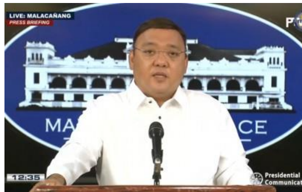
Presidential Spokesperson Harry Roque. (File photo)