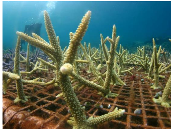
Healthy coral outgrowths in HMC's coral nursery.