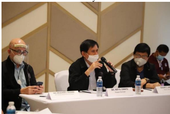
Environment Secretary Roy Cimatu, chief coronavirus disease (COVID-19) response implementor in the Viayas

CEBU CITY – Twenty-one Cebu City barangays with the most number of active coronavirus disease (COVID-19) cases are facing granular lockdown once an executive order is issued by Cebu City Mayor Edgardo Labella, and confirmed by the regional Inter-Agency Task Force (IATF), according to Environment Secretary and COVID-19 response overseer for Cebu Roy Cimatu.