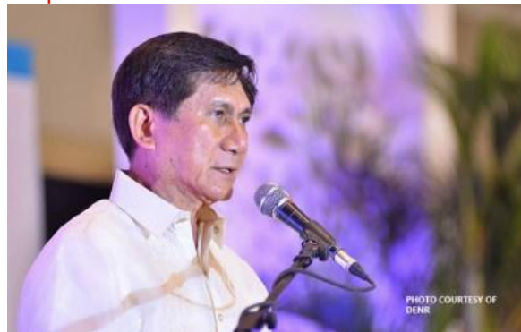
DENR Secretary Roy Cimat

MANILA – Department of Environment and Natural Resources Secretary Roy Cimat said Wednesday the Duterte administration prioritizes climate change issues amid the coronavirus pandemic.