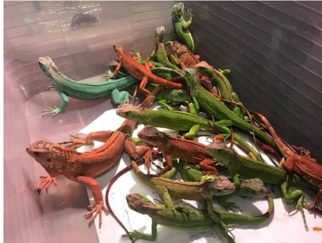
All lizards came from Thailand.

The Metropolitan Trial Court (MTC) of Pasay City has convicted a wildlife smuggler caught by airport customs officers with 63 different lizards in his luggage in February 2019.