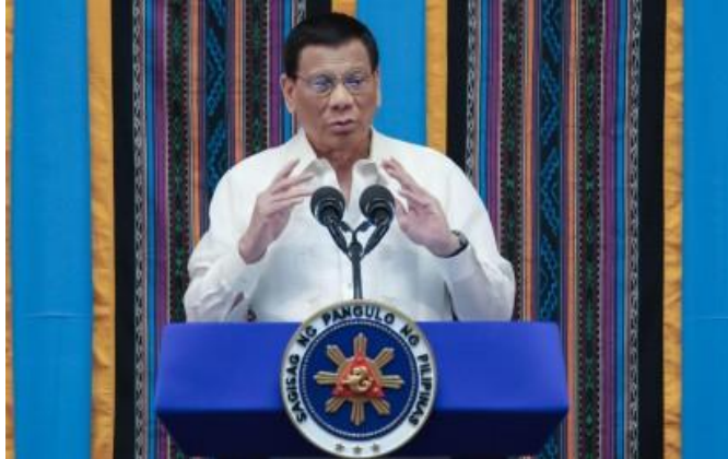
President Rodrigo Duterte