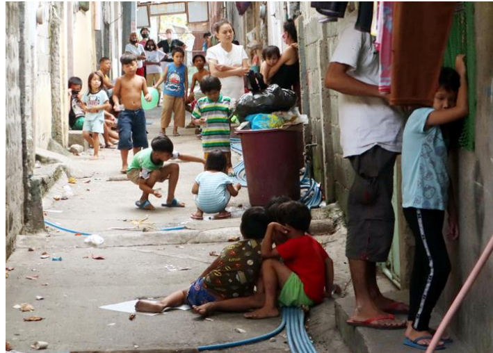
SLUM SITUATION. Adults and children alike seem unmindful of the raging coronavirus pandemic as they play and congregate outside their houses—without face masks—along alleyways in an impoverished neighborhood in Cavite province. JR Josue

The total number of people in the Philippines infected with COVID-19 has reached 70,764, the Department of Health (DOH) said Tuesday.