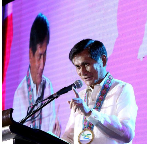
Environment Secretary Roy Cimatu. | file photo

By: Delta Dyrecka Letigio - CDN Digital|July 21,2020 - 06:58 PM