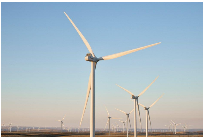
The Montague wind farm in Oregon is one of Apple's largest projects at 200 megawatts and powers Apple's Prineville data center.

SAN FRANCISCO - Apple pledged Tuesday to be carbon neutral across its entire business, including its manufacturing supply chain, by 2030, in a stepped up push to fight climate change.