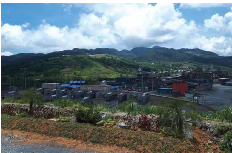
The Didipio Mine of OceanaGold Philippines Inc. that straddles Quirino and Nueva Vizcaya.

KASIBU, Nueva Vizcaya: Australian OceanaGold miner has expressed optimism that the company will be back to normal operations at its Didipio Gold and Copper Project in this gold-deposit rich upland town.