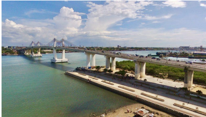
An aerial shot of the Marcelo Fernan Bridge that connects Mactan Island to mainland Cebu.