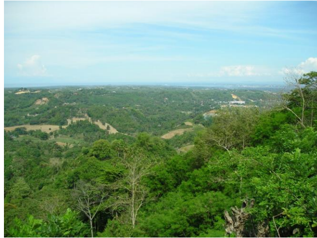
Barangay Guba in Cebu City. | Google photos

By: Delta Dyrecka Letigio - CDN Digital|July 15,2020 - 08:33 PM