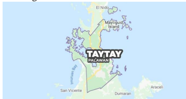
Image from Google Maps.