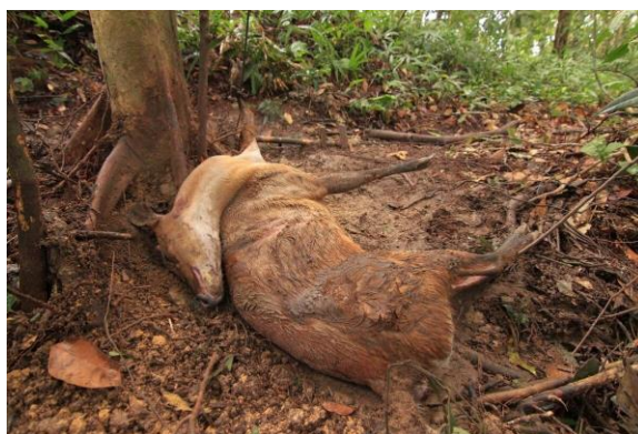
A snared barking deer discovered in Royal Belum State Park, Malaysia. The snare was suspected to have been set by Vietnamese poachers.

WWF noted that 58 per cent of all identified human pathogen species are known to originate from animals. Zoonotic diseases include rabies, Ebola, tuberculosis, and emerging coronaviruses such as Severe Acute Respiratory Syndrome (Sars), Middle East Respiratory Syndrome (Mers), and most recently, Covid-19.