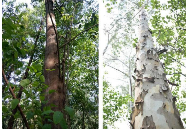
Large-fruited red mahogany (left) and river red gum (right) are two of the most common ITPS planted in the country.

The country's wood industries have been suffering from a shortage of raw materials for many years now. This has been caused mainly by decades of indiscriminate logging which have systematically reduced the areas of the country's natural growth forests.