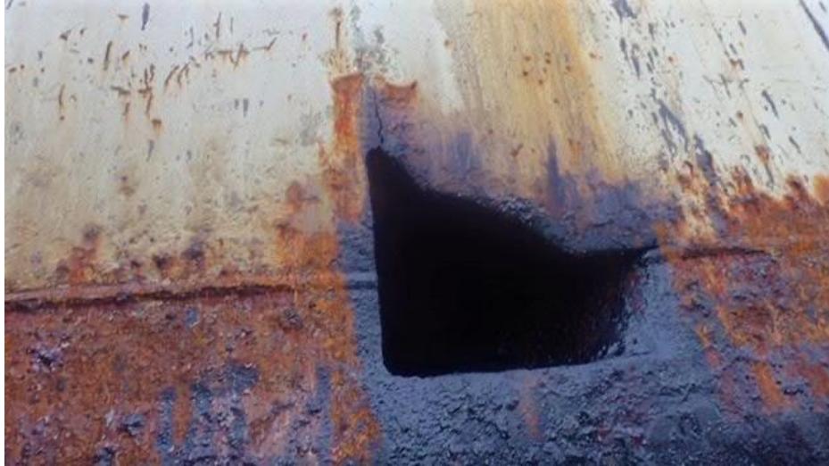
HE damaged hull of Barge 102.

The Philippine Coast Guard (PCG) has filed a complaint for violations of Section 107 of the Philippine Fisheries Code against barge operator AC Energy Inc. over the oil spill incident last 3 July off the waters of Iloilo.