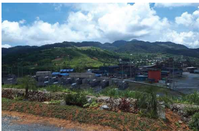
The Didipio Mine of OceanaGold Philippines Inc. that straddles Quirino and Nueva Vizcaya.

BAYOMBONG, Nueva Vizcaya: The Court of Appeals (CA) has denied OceanaGold Corp.'s petition to continue its mining operations at the Didipio Mines in Kasibu town here.