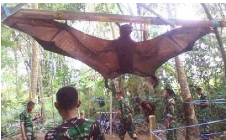
Filipino soldiers have some fun with a captured megabat. Smoking is bad for you!