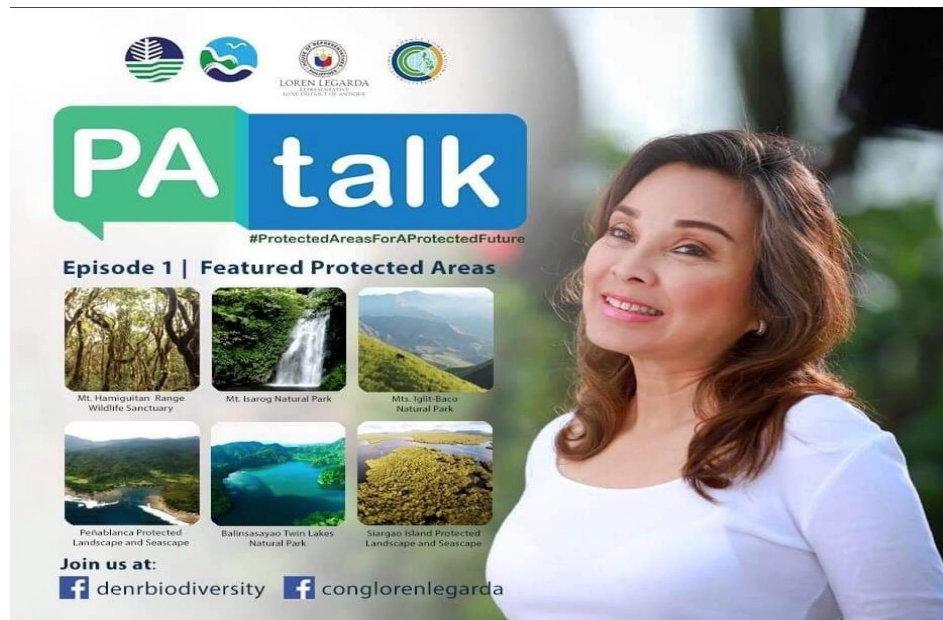
House Deputy Speaker and Antique Representative Loren Legarda