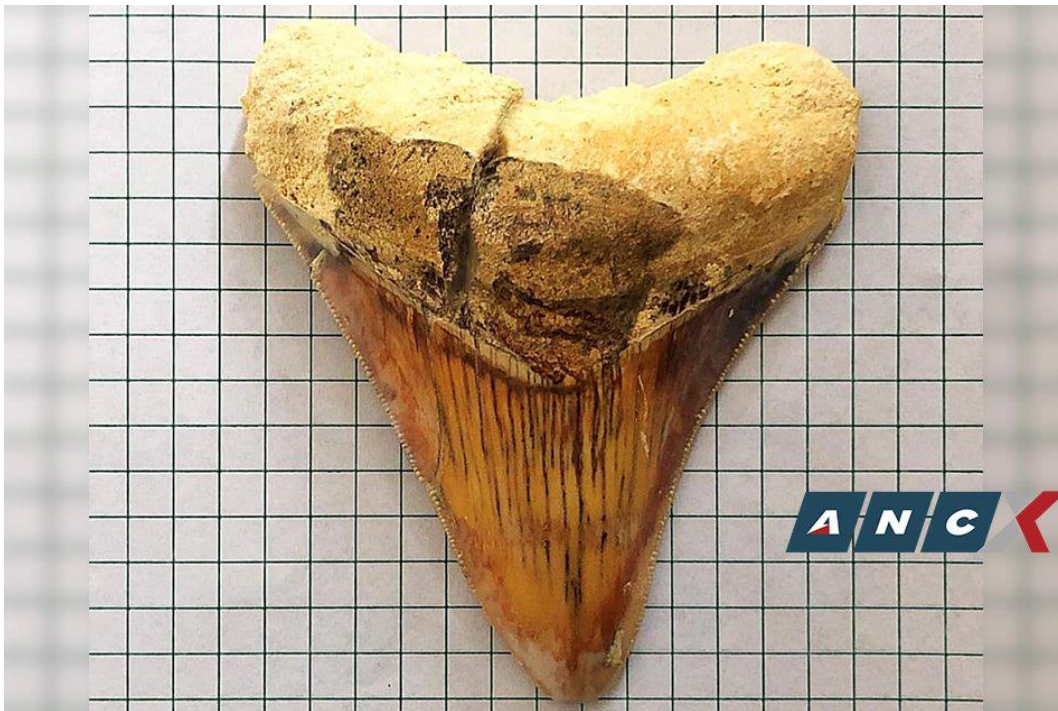
A megalodon tooth fossil was recently discovered from the Bohol municipality of Maribojoc.

https://news.abs-cbn.com/ancx/culture/spotlight/07/03/20/an-extinct-sharks-fossil-tooth-as-big-as-a-palm-is-found-in-bohol