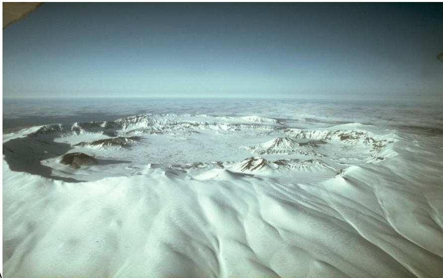
The crater of Okmok, the Alaskan volcano whose eruption in 43 BCE caused a distinct chill across the northern hemisphere.

An Alaskan volcano once spurred climate change, darkening Mediterranean skies, launching a famine and possibly changing history.