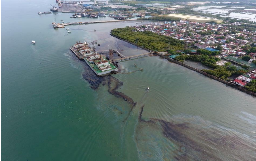
An aerial view of the spillage of the bunker fuel that gushed out of Power Barge 102 owned by AC Energy Corp. in Iloilo City Friday afternoon. (Leo Solinap)

At least 48,000 liters of bunker fuel were spilled into the Iloilo Strait, the body of water separating Iloilo City and the island province of Guimaras, after a power barge exploded Friday afternoon.