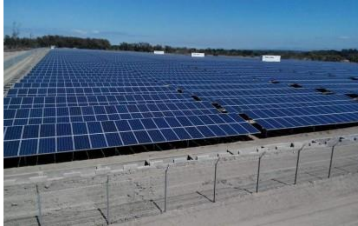
Solar energy farm in Currimaos, Ilocos Norte

MANILA – Investors in the renewable energy sector are urged to look into opportunities in the Philippines as the country targets to achieve the 15,304-megawatt (MW) renewable capacity by 2030.