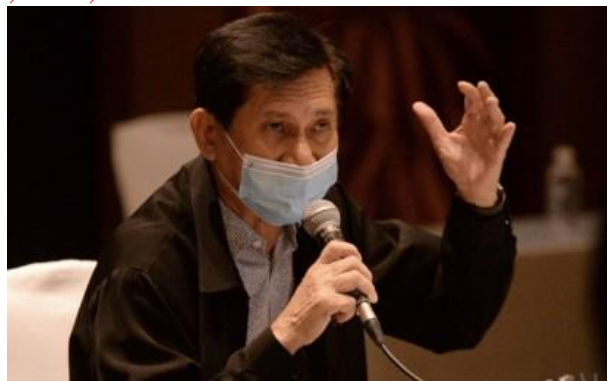
Department of Environment and Natural Resources Secretary Roy Cimatu

By John Rey Saavedra June 26, 2020, 7:32 am