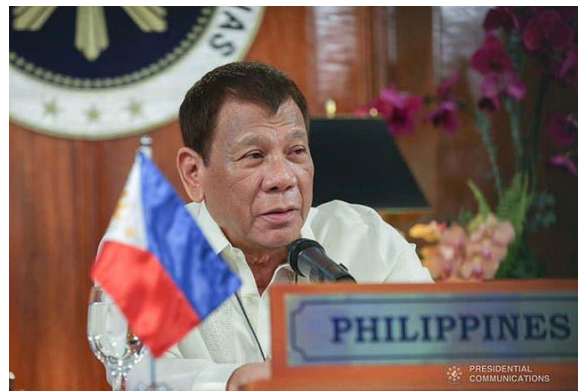
President Rodrigo Roa Duterte gives his intervention as he joins other leaders from the Association of Southeast Asian Nations (ASEAN) member countries during the 36th ASEAN Summit video conference at the Malago Clubhouse in Malacañang on June 26, 2020.

PRESIDENT Rodrigo Duterte called on the Association of Southeast Asian Nations (Asean) to exercise self-restraint and respect the rule of law to avoid “escalating tension” in the disputed South China Sea.