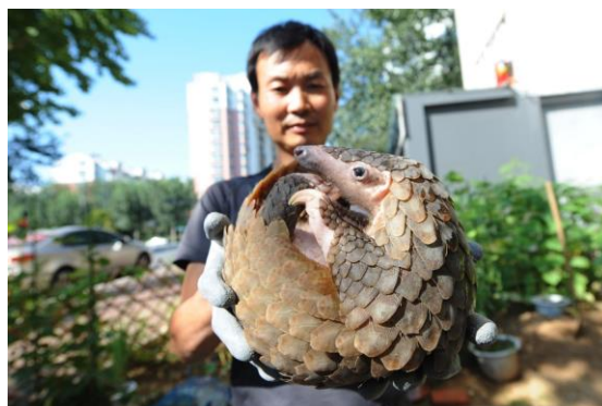
A pangolin to be released back into the wild in southern China, after being rescued in Qingdao city, east China's Shandong province.

Experts say pangolin scales are still being legally traded in China based on a loophole in the country's Wildlife Protection Law, which allows the trade of protected species in special circumstances.