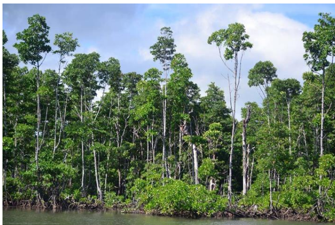
A coastal forest near the Malampaya Sound Protected Landscape and Seascape in the northwestern part of the Palawan. Coastal forests are known habitats of the Philippine red-vented cockatoo.

With slightly over 1,200 cockatoo individuals left in the wild, they remain on top of the list of endemic species threatened with extinction.