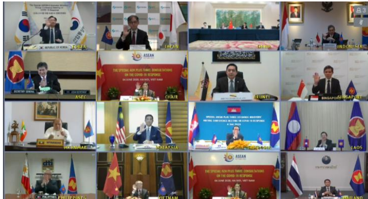
ASEAN Economic Ministers Plus Three consultations on the COVID-19 response.

Economic Ministers from the People's Republic of China, Japan, and the Republic of Korea have expressed serious concerns about the growing COVID-19 cases in the region and around the world. In a joint public statement, the Economic Ministers extended their deepest sympathies to the numerous loss of lives, and they sought that the pandemic should be dealt with within the soonest possible time to prevent greater economic impact.