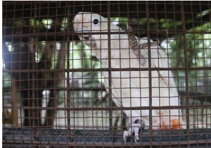
A red-vented cockatoo at the Wildlife Rescue Center in Quezon City.

With a once-thriving population over the Philippine archipelago, the population of the red-vented cockatoo has drastically decreased in the 1990s due to persistent poaching and the massive destruction of their habitats.