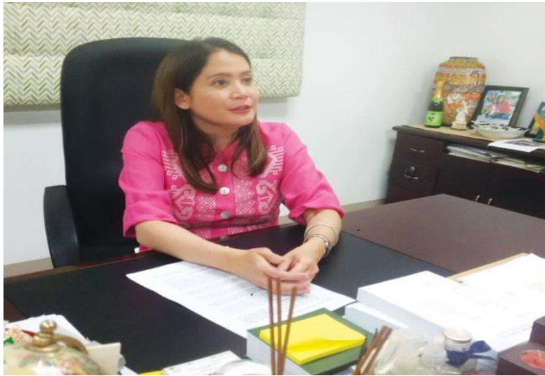
File Photo: Tourism Secretary Berna Fatima Romulo-Puyat

https://businessmirror.com.ph/2020/06/19/boracay-hotel-may-lose-business-permit-for-hosting-partying-staff-of-bfp/