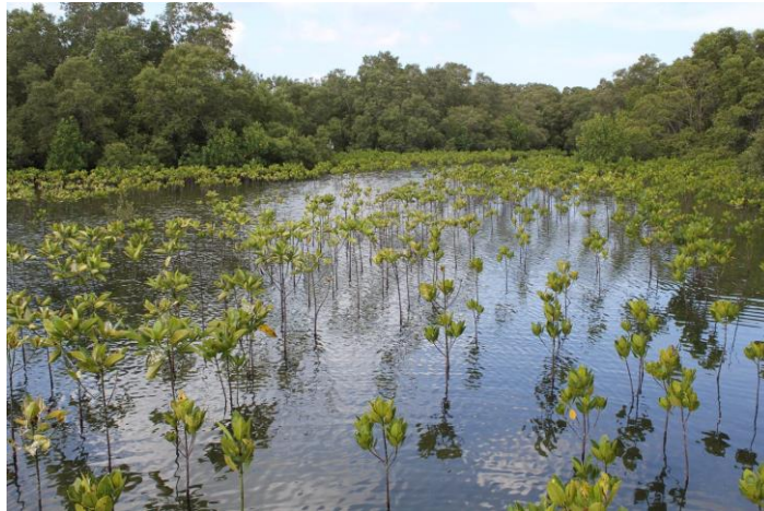
Mangroves in Batangas in the Philippines.

Rising tides driven by global heating could swamp the mangrove forests – bad news for the natural world, and for humans.