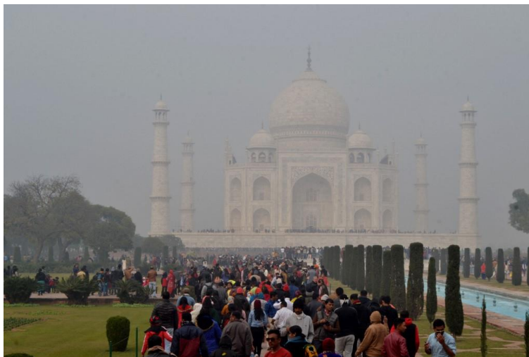
Tourists visit The Taj Mahal under heavy smog conditions in Agra on December 28, 2019.

Agence France-Presse / 03:29 PM June 18, 2020