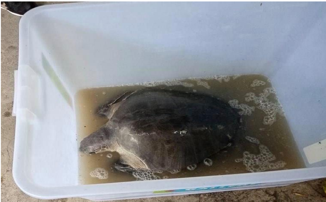
A sea turtle and an Eastern grass owl were rescued in the villages of Central Tabao and Mabini in Valladolid, Negros Occidental, respectively, on June 15, 2020.

BACOLOD CITY – A sea turtle and an Eastern grass owl were rescued in the villages of Central Tabao and Mabini in Valladolid, Negros Occidental, respectively, on Monday.