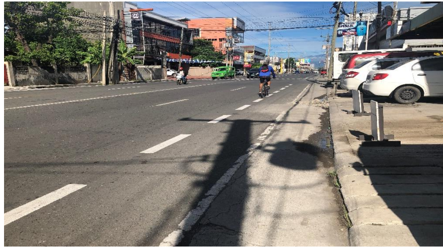
A lone cyclists pedals his way along the newly demarcated bike lane along Quimpo Boulevard