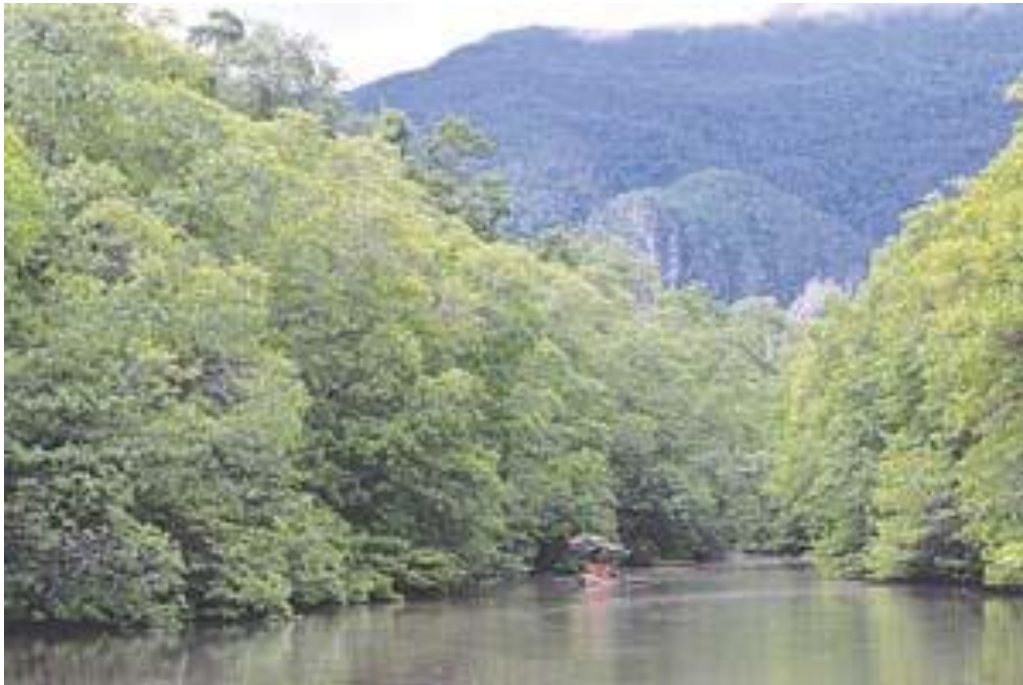
File photo: The mangrove forest area of the Puerto Princesa Underground River is now used by the community in offering mangrove tours to tourists.

https://cnnphilippines.com/news/2020/6/16/MMDA-bike-lanes-public-utility-vehicles.html