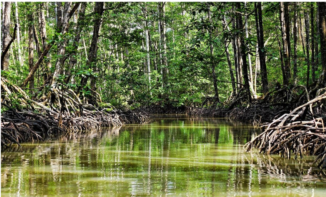
A mangrove forest at low tide in Puerto Princesa, Palawan.

Police on the Philippine island of Palawan reportedly assaulted and arrested government environmental officials trying to serve a vacate notice to settlers occupying a mangrove area.