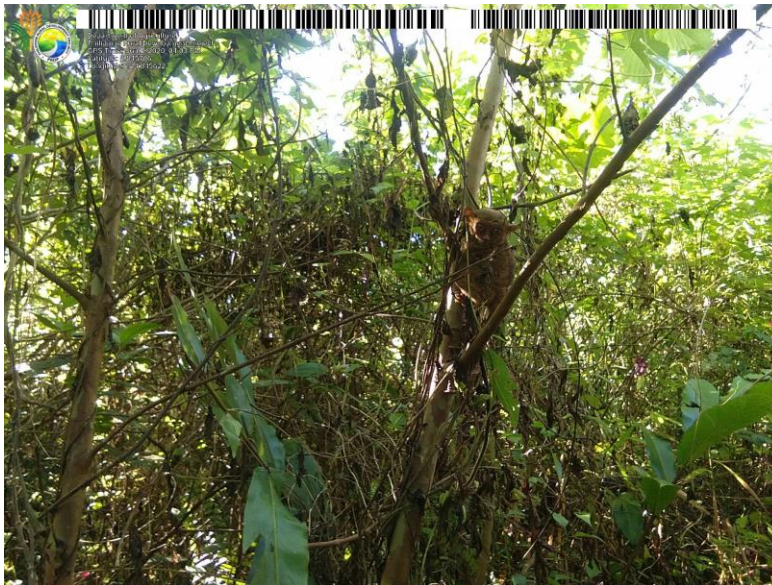
A picture of the rescued Tarsier that was released on the forest the same day it was rescued.