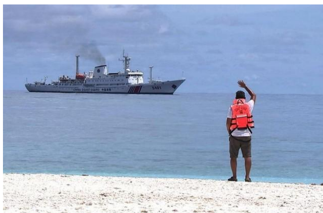
A journalist waves at a Chinese Coast Guard vessel from a sandbar near Pag-asa Island

The locals tell us that the features of Sandy Cay used to be camping grounds for fishermen and their children, who would swim in the morning and feast on fresh fish caught just a few meters from shore. But now this seems no longer possible.