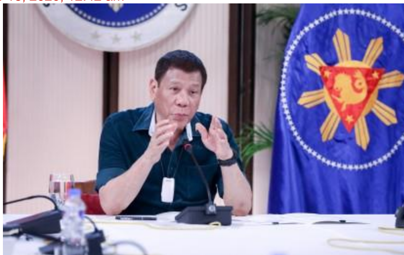
President Rodrigo Duterte ( file photo )

By Azer Parrocha June 16, 2020, 12:42 am