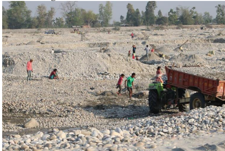
Labourers load river aggregates on a tractor, Mahakali River, Nepal.

The transboundary rivers of South Asia are seeing increased business investments and infrastructure development. There is a growing need for the integration of businesses and human rights frameworks in water governance decision-making.