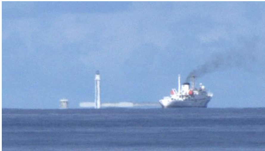
This video screen grab shows the Chinese lighthouse on Subi Reef, with a Chinese Coast Guard ship in the foreground.

Defense Secretary Delfin Lorenzana would confirm the presence of the militia around Pag-asa Island when he flew in last week to inaugurate a concrete beaching ramp , one of the many government infrastructure projects being undertaken on Pag-asa.