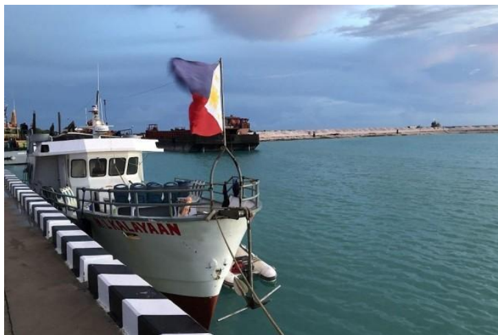
The Kalayaan Municipal boat is seen berthed in Pag-asa Island's newly constructed Sheltered Port. Chino Gaston

Night is falling on Pag-asa Island, a slow, drawn out march to darkness unlike any other place in this country. I can still make out the Chinese fishing boats, hovering about the sandbars of Sandy Cay. They sit on the water, unmoving, no sign of life onboard save for the flickering of the odd utility light or an occasional rubber boat moving between them.