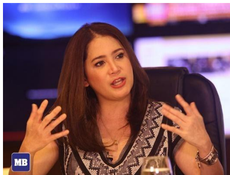
Tourism Secretary Bernadette Romulo- Puyat

Expect a “contactless” Boracay experience on its resumption of domestic tourism, according to Department of Tourism (DOT) Secretary Bernadette Romulo-Puyat, as the island is ready to take in guests from the Western Visayas region beginning Tuesday (June 16) after months of closure due to COVID-19.