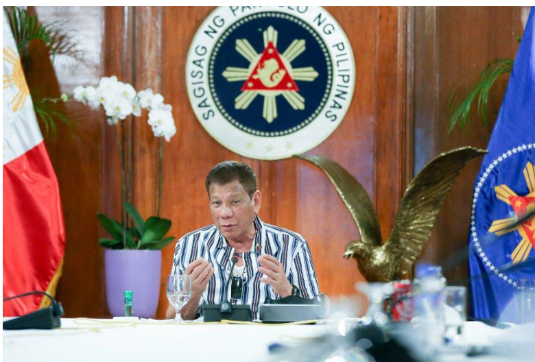
President Rodrigo Duterte holds a meeting with members of the Inter-Agency Task Force on the Emerging Infectious Diseases (IATF-EID) at the Malago Clubhouse in Malacañang on June 15, 2020.

MANILA - President Rodrigo Duterte late Monday night reiterated his warning to Filipinos against going outside their homes amid the coronavirus disease 2019 (COVID-19), stressing that the country's fight against the pandemic "is not over."