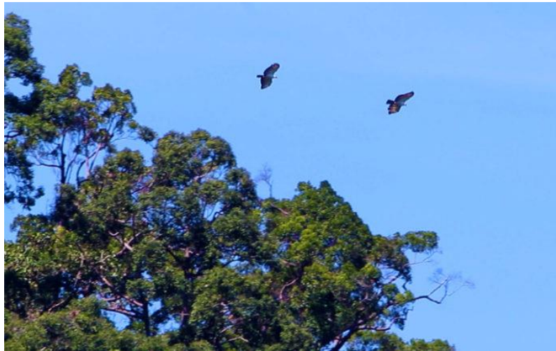
A Philippine eagle pair soaring together.

All hope is not lost for the iconic Philippine eagle. An on-going research on the world's largest bird of prey in Zamboanga City confirmed the presence of at least one Philippine eagle family in Pasonanca Natural Park in the city.