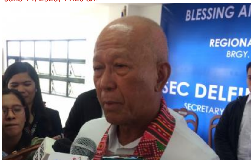
Defense Secretary Delfin Lorenzana (File photo)