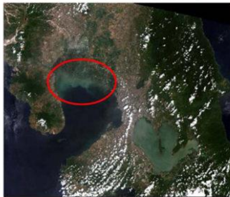
March 14, 2017 Sentinel-2 image