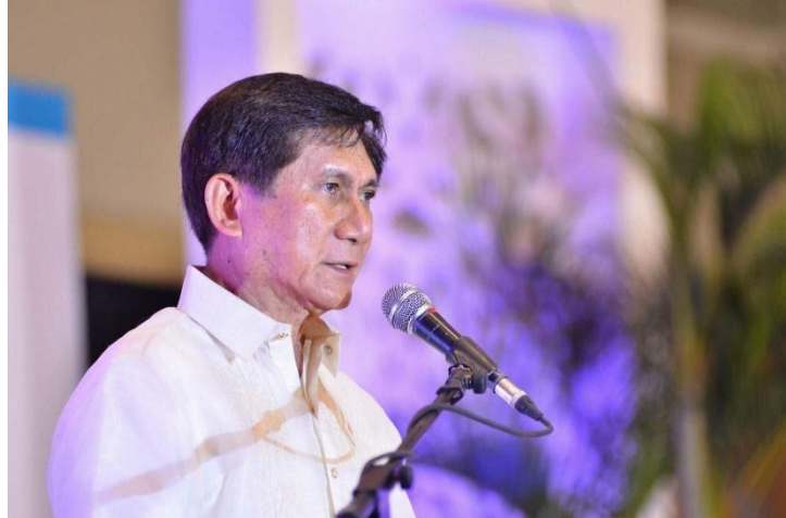
DENR Secretary Roy Cimatu

PUERTO PRINCESA CITY, Palawan – Environment Secretary Roy Cimatu condemned the reported arrest of environment personnel by the Philippine National Police (PNP) here.