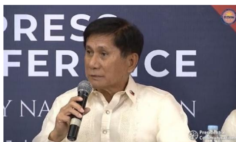
Environment Secretary Roy A. Cimatu

Environment and Natural Resources Secretary Roy Cimatu on Sunday (June 14) appealed to authorities to ensure the imposition of maximum punishment on habitual environmental law offenders.