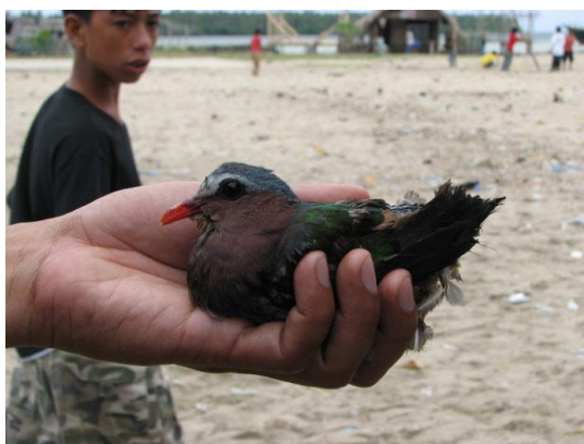
Direct handling of a common emerald dove.

Did you know that wildlife also experience a lot of stress? Bushmeat hunting for consumption pushes several terrestrial or land-based mammal species to the brink of extinction while agitating hunted animals.