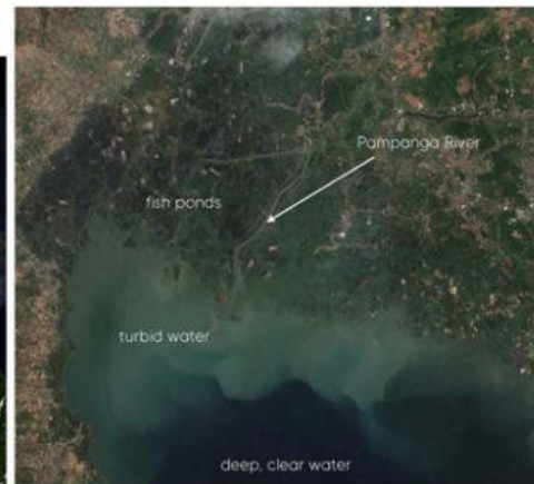
Satellite image processing for mapping of water quality and other features

Development of Integrated Mapping, Monitoring, and Analytical Network System for Manila Bay and Linked Environments