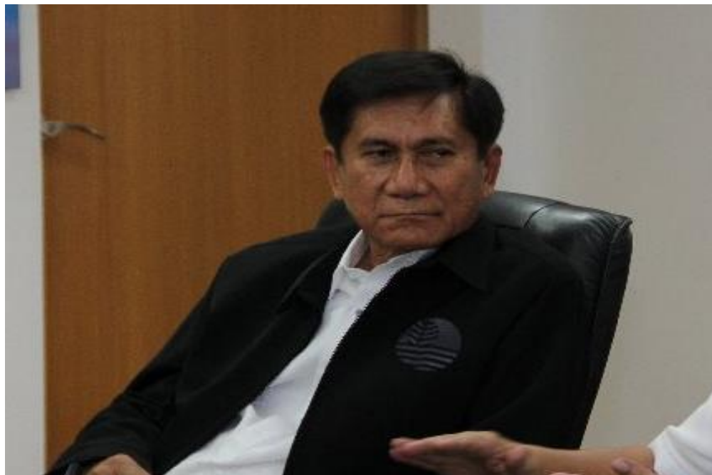
Environment Secretary Roy Cimatu

Environment and Natural Resources Secretary Roy Cimatu was “outraged” by the unlawful arrest and detention of eight employees of the Department of Environment and Natural Resources (DENR) and two others while they were doing field work at Barangay Iwahig in Puerto Princesa City last June 10.