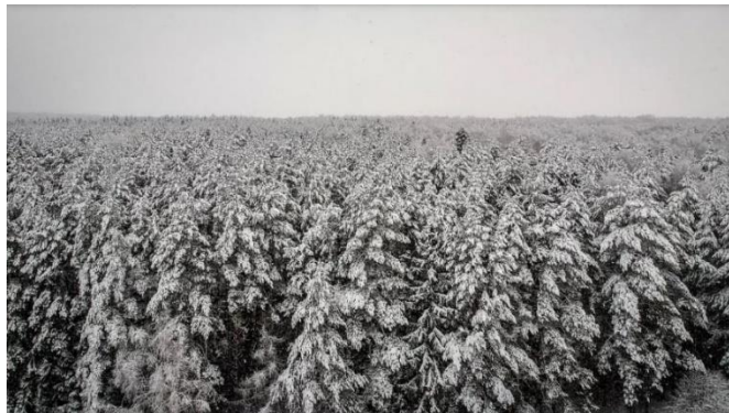
Russia's Siberia region, best known as an icy tundra, is being transformed by climate change

Best known as a vast, cold tundra, Russia's sprawling Siberia region is being transformed by climate change that has brought with it warmer temperatures, forest fires and growing swarms of hungry moth larvae.