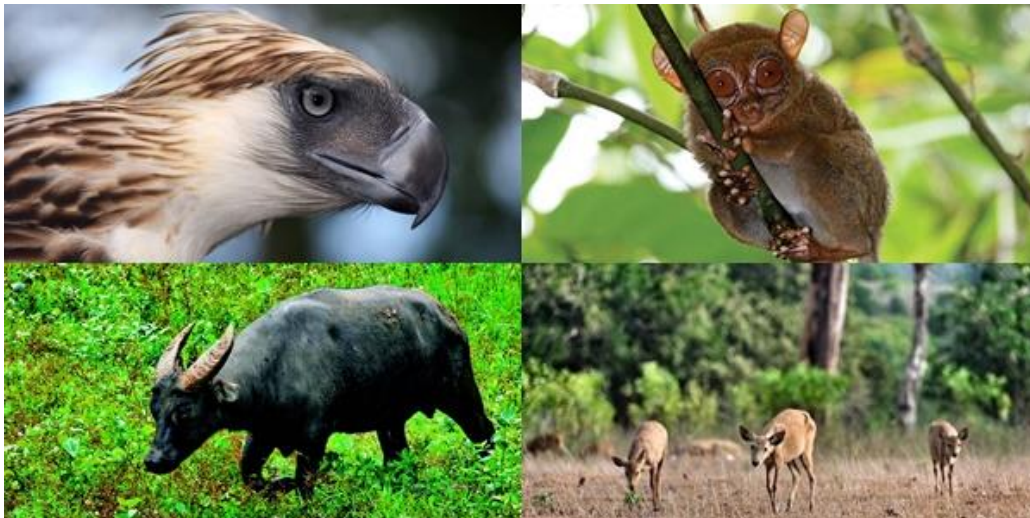
Public Domain Image

Nanguna si Villar sa mga nagnanais na maamyendahan ang Republic Act 7586 o National Integrated Protected Areas System (NIPAS) Act of 1992.