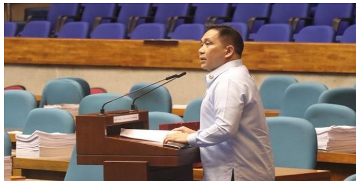
Rep. Manuel Cabochan III (Party-list, MAGDALO)

Rep. Manuel Cabochan III wants to require the use of recyclable or biodegradable materials for the packaging of consumer products to ensure the conservation and preservation of the country's natural environment.