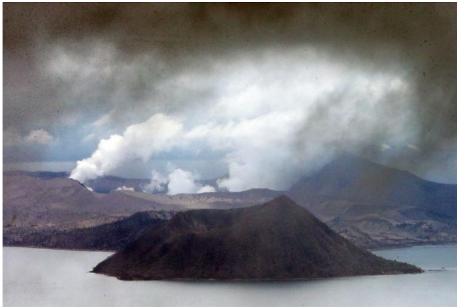
Taal Volcano (EDWIN BACASMAS)

https://newsinfo.inquirer.net/1288422/taal-volcano-rumbles-5-earthquakes-recorded