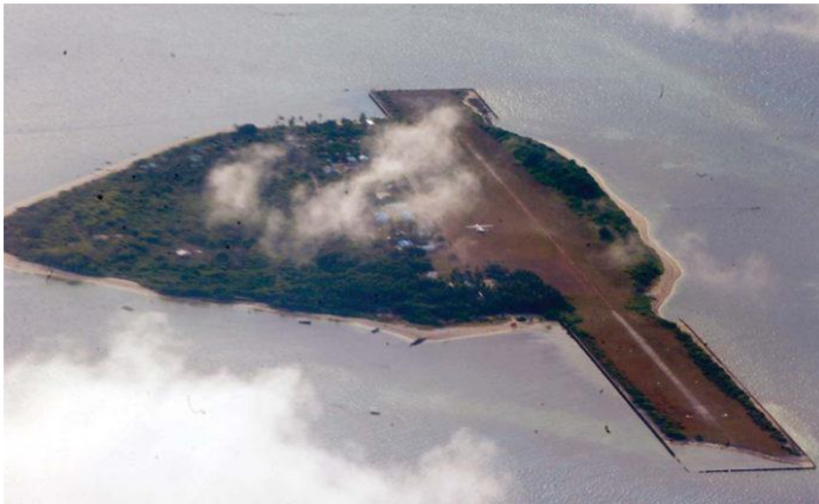
The Philippine-claimed Kalayaan (Thitu) Island on the Spratlys chain of islands is shown off the West Philippine Sea, April 21, 2017.

https://businessmirror.com.ph/2020/06/09/china-owes-us-p33-billion-in-annual-marine-loss/