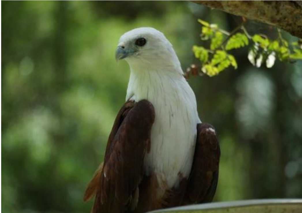
Brahminy kite, known as Lawin

https://businessmirror.com.ph/2020/06/10/wildlife-trader-charged-over-p20000-offer-to-sell-a-pair-of-lawin-birds/