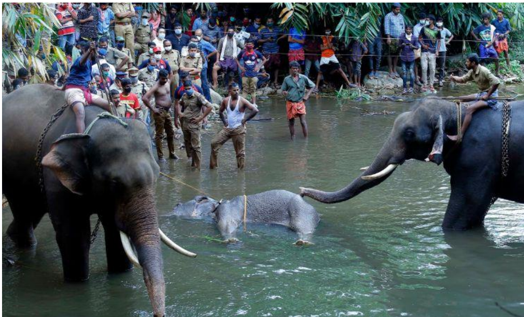
A dead elephant is retrieved from a river in the Palakkad district of Kerala.

https://cnnphilippines.com/world/2020/6/4/pregnant-elephant-death-india-firecrackers.html