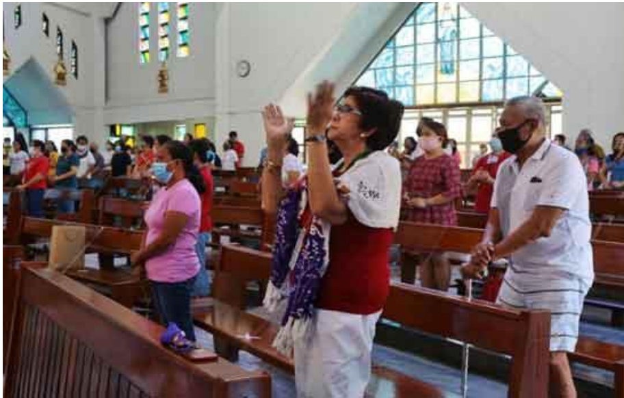
FAITH MASK Catholic devotees observe physical distancing although not necessarily the wearing of face masks at the Sta. Rita Church in Baclaran, Parañaque City on May 17, 2020.

Religious gatherings are now allowed in modified general community quarantine (MGCQ) areas but only with half the number of worshippers.