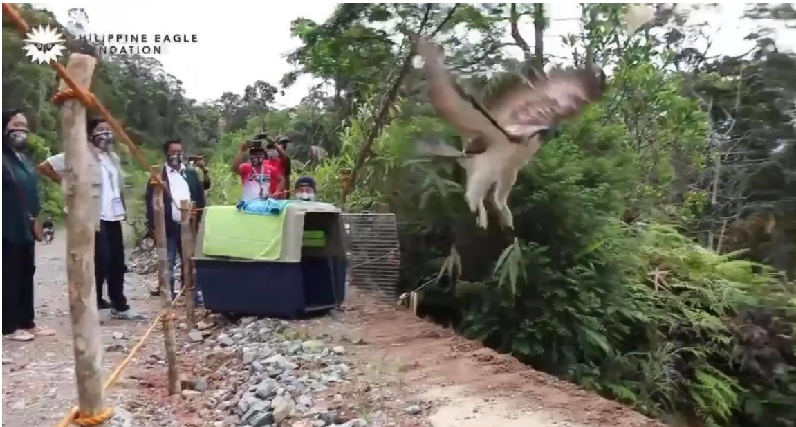
The Philippine Eagle Foundation (PEF) released a successfully rehabilitated Philippine eagle in a protected area.

https://news.mb.com.ph/2020/06/04/rehabilitated-philippine-eagle-released/