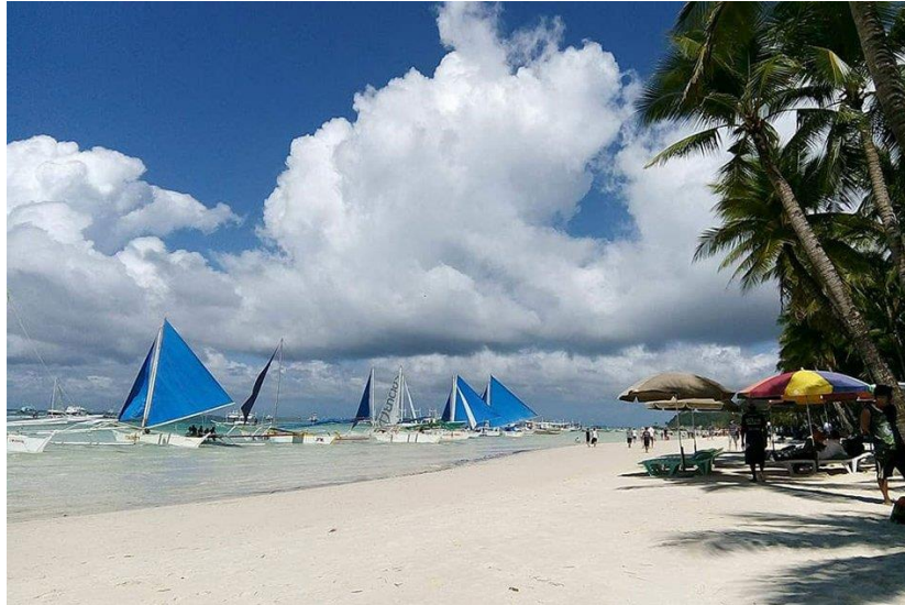
Boracay. File photo

https://news.abs-cbn.com/life/06/04/20/forbes-names-ph-one-of-rising-stars-in-post-quarantine-travel