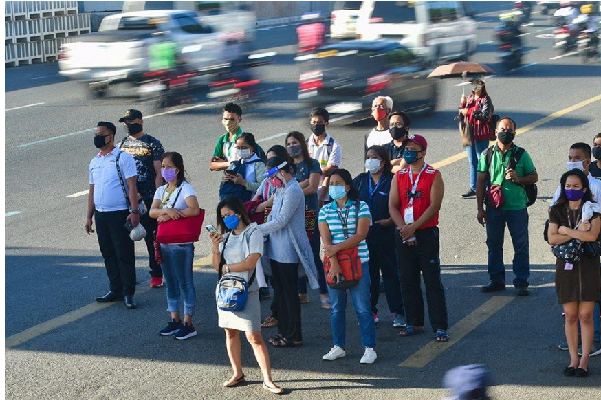
Commuters wait for a ride along Commonwealth Ave in Quezon City on June 2, 2020, the second day of general community quarantine in Metro Manila.

https://news.abs-cbn.com/business/06/04/20/unemployment-jump-to-show-lockdown-toll-on-philippines-economy