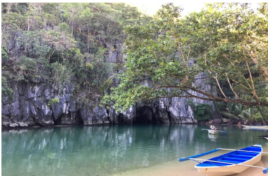
Puerto Princesa Underground River. —ROBERT JAWORSKI ABAÑO Special laws

“While Provincial Ordinance 2210 anchors its legal basis on Section 16, Article 2 of the Constitution and Section 16 of (Republic Act No.) 7160 (Local Government Code), we submit that such basis is wanting when it comes to protected areas,” Mayo-Anda said in the letter sent on Wednesday.