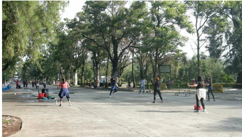
Fitness and wellness enthusiasts in a park enjoy the cool Baguio morning.

Published 22 hours ago on May 31, 2020 10:18 AM By Aldwin Quitasol