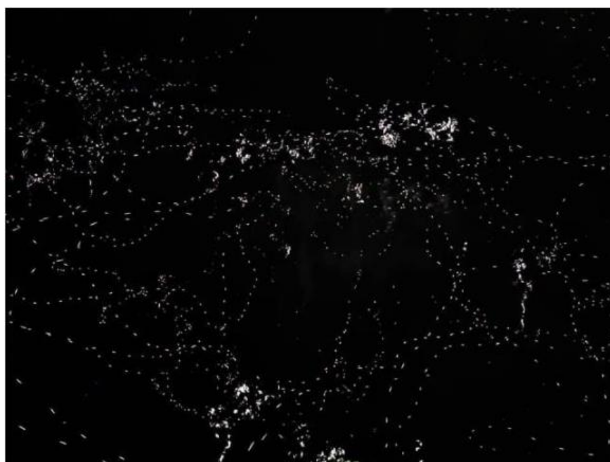
FB: Masungi Georeserve

The Masungi Georeserve covers over 3,000 hectares of land located in the southern Sierra Madre range in Baras, Rizal. It has been practicing conservation efforts for over 15 years.