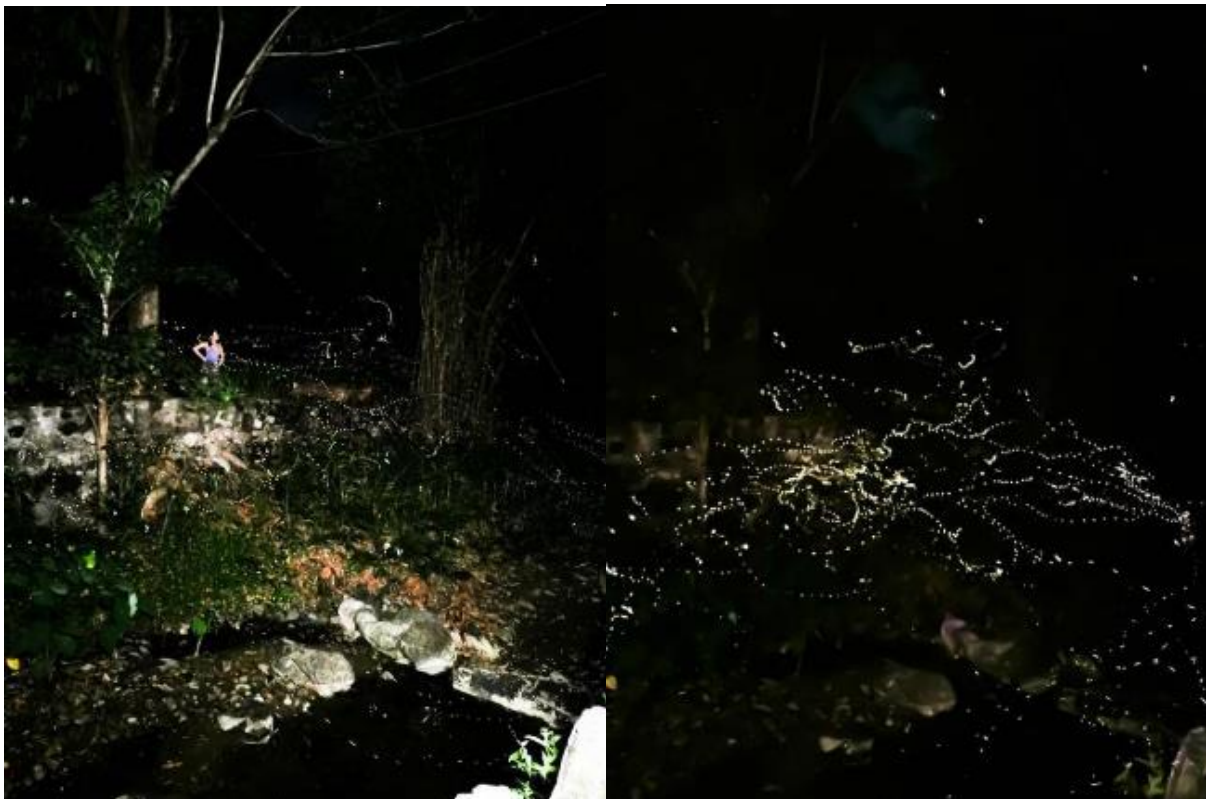
FB: Masungi Georeserve

"We are thankful to see these tonight as it reaffirms our work in protecting the Masungi landscape and restoring its amazing biodiversity," it added.