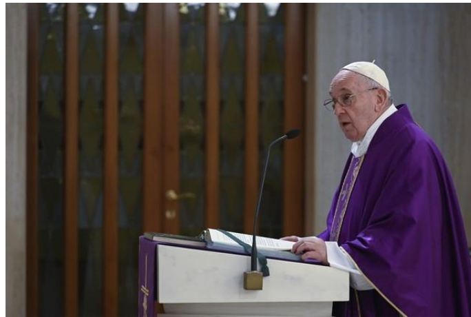
THE Pope's message. This photo taken on 26 March 2020 by the Vatican Media shows Pope Francis delivering his homily while celebrating a private morning mass at the Santa Marta chapel in The Vatican.

Published 6 hours ago on June 1, 2020 03:00 AM By Agence France-Presse