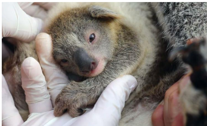
The park introduced Ash to the world in a Facebook video.

(CNN) -- A wildlife park in Australia is celebrating the arrival of its first baby koala since bushfires devastated the area.