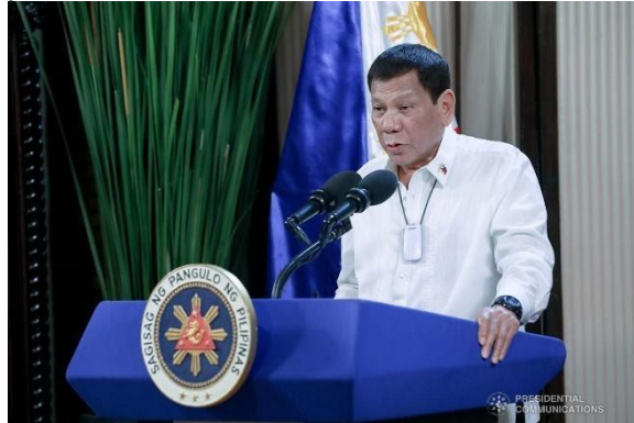
President Rodrigo Roa Duterte

The Philippines and Vietnam have agreed to settle their respective territorial disputes with China in the South China Sea through peaceful means.