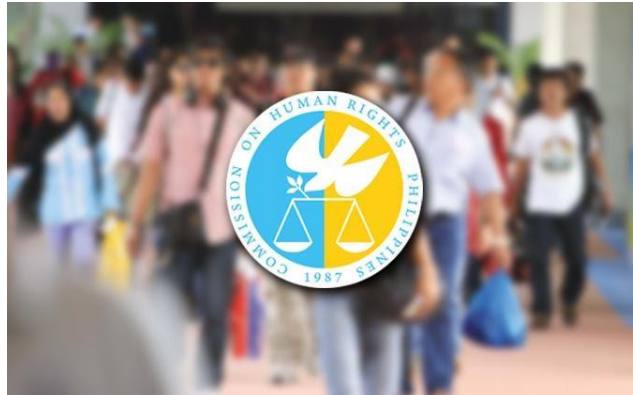
Commission on Human Rights

The Commission on Human Rights (CHR) has lauded Ayala Corporation for its decision to get rid of its investments in coal-fired powered investments by 2030 as a positive step forward in the world's fight against climate change.