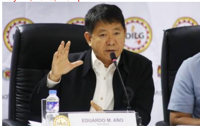
DILG Secretary Eduardo Año.